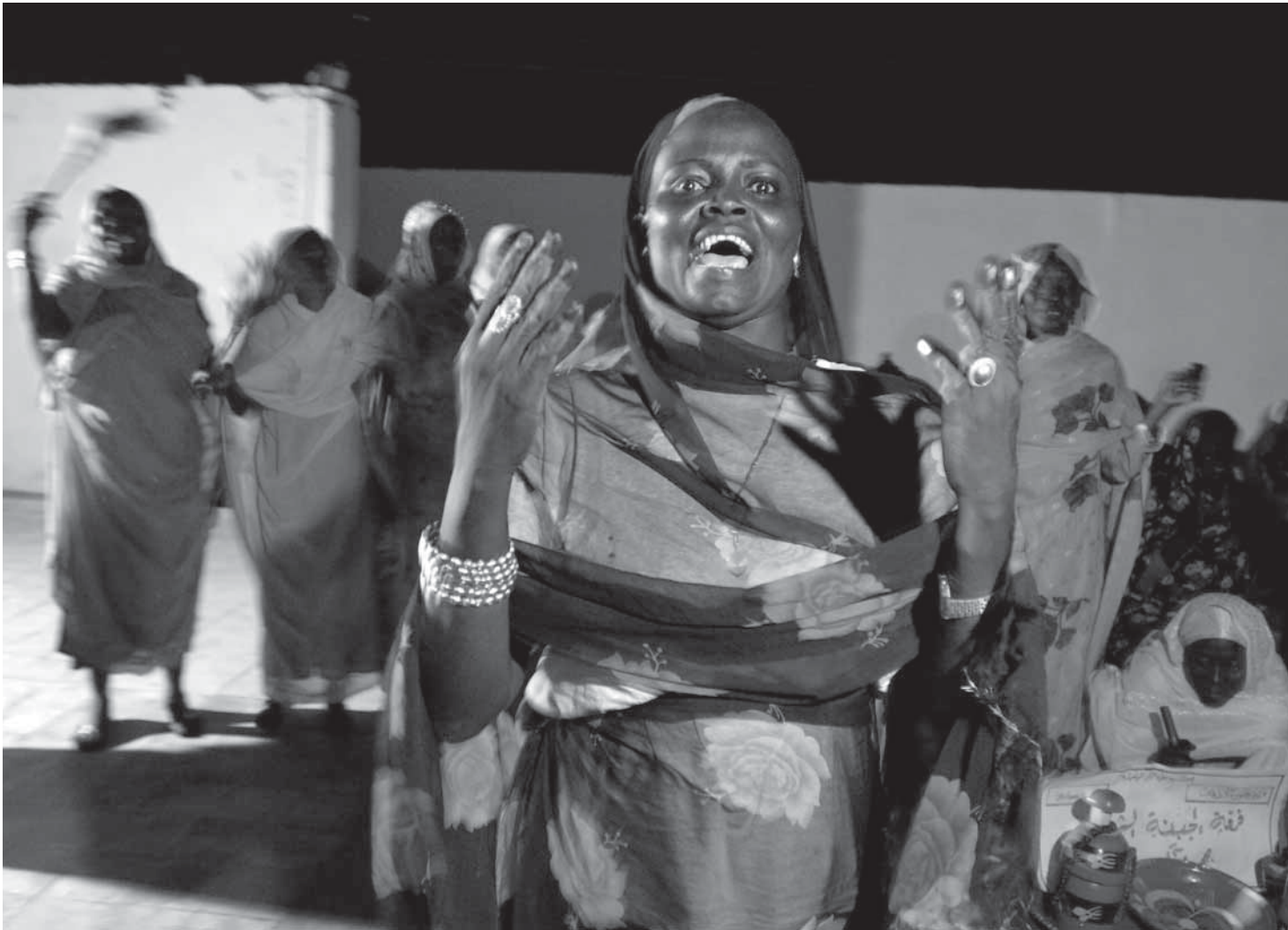
A group of Hakama women, who once inspired men to fight, rehearse for a theatrical performance highlighting the need for peace and reconciliation. The performance marked a crucial part of the efforts of the United Nations Mission in Sudan to disarm, rehabilitate and reintegrate militia fighters. Kadugli, Sudan, 5 December 2006.

mediators were under pressure to secure an effective ceasefire agreement; to keep the parties talking even while the ceasefire was violated; to keep the talks going when the Darfur conflict escalated and drew international attention; and as the talks stretched on for longer than expected, they needed to bring the process to a successful and credible end.