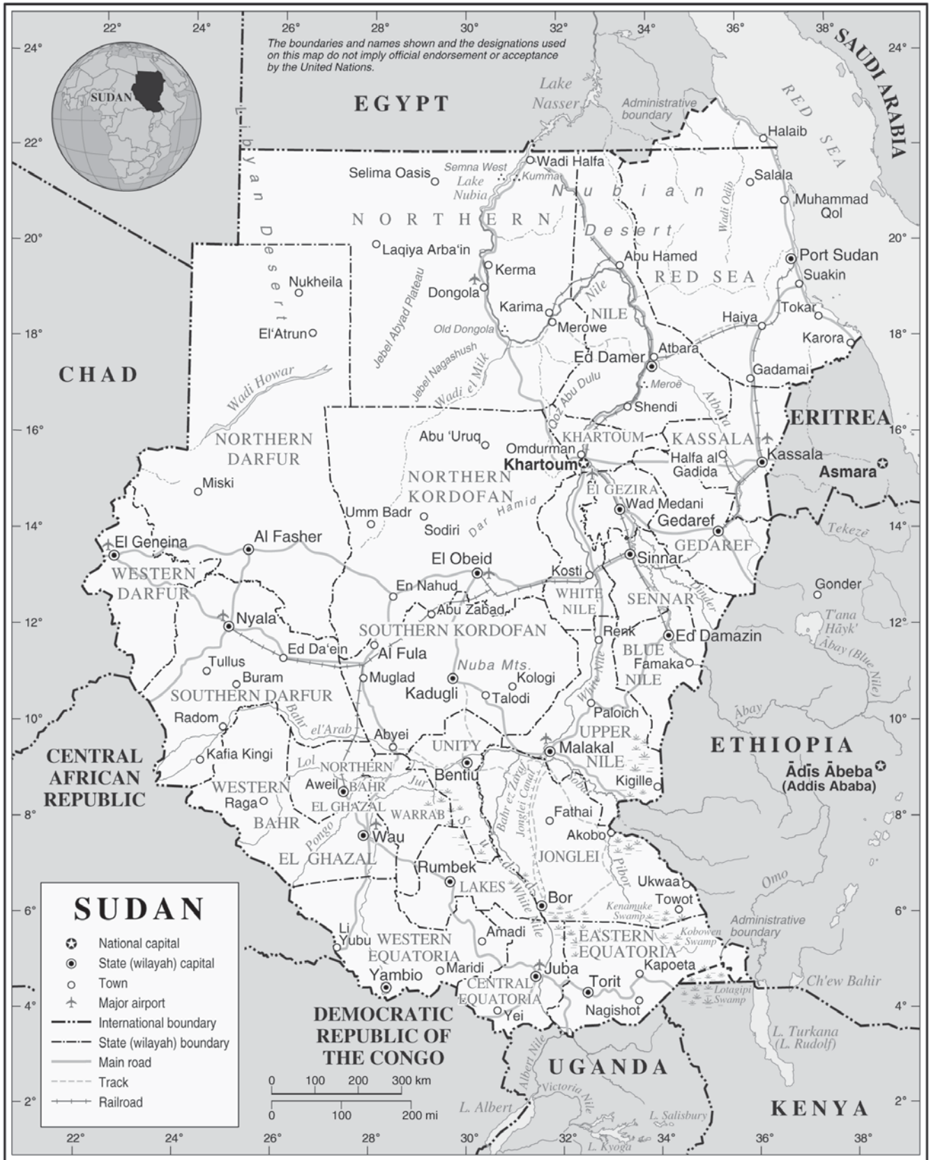
Map No. 3707 Rev. 10 UNITED NATIONS April 2007