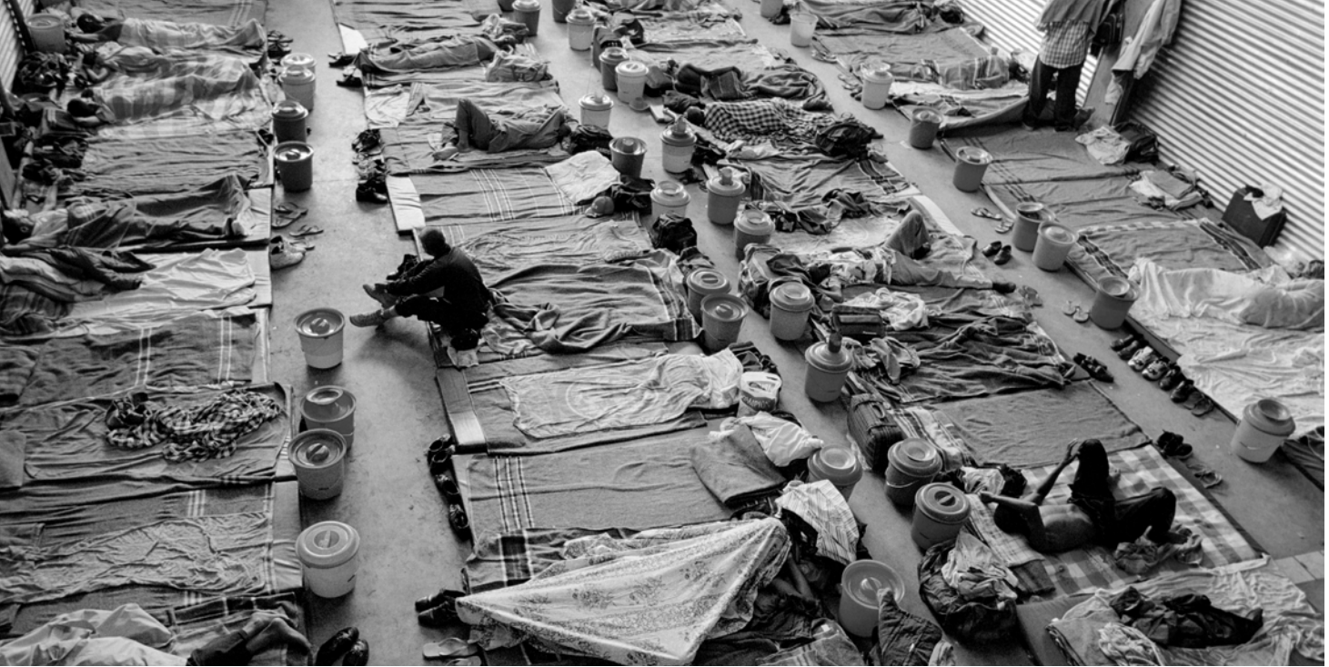
Demobilisation centre for former government soldiers, Gitega, Burundi.

As one senior UN official observed, “at the moment it depends on ad hoc initiatives. . . It would be good if it were mandated by the UN Security Council, with agreements with governments, and with funding through that route.” 149