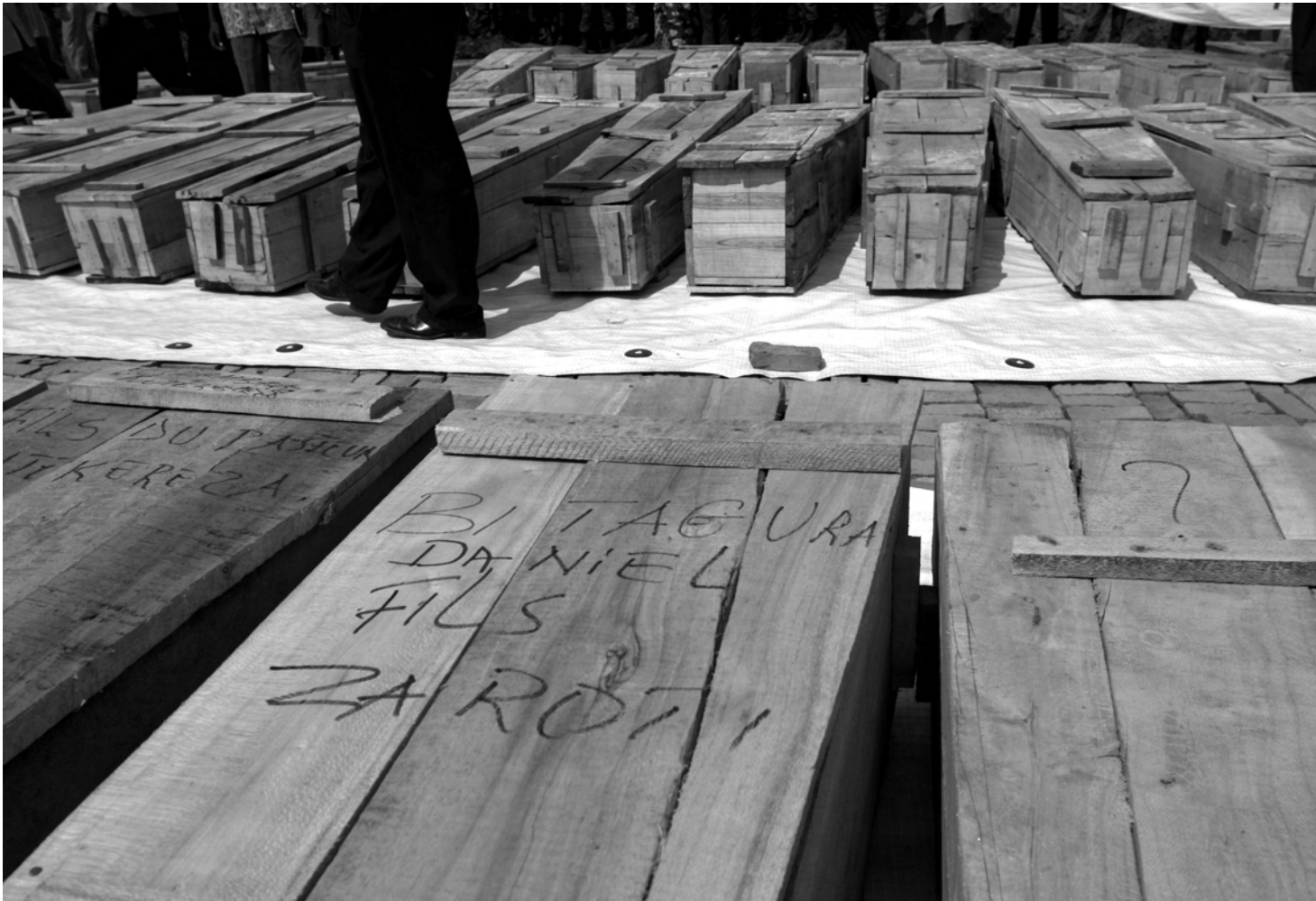
A man walks past coffins prepared for burial in a mass grave in Gatumba, Burundi, 16 August 2004.

notwithstanding—was nevertheless sufficient to fulfil the requirements of the Arusha Agreement.