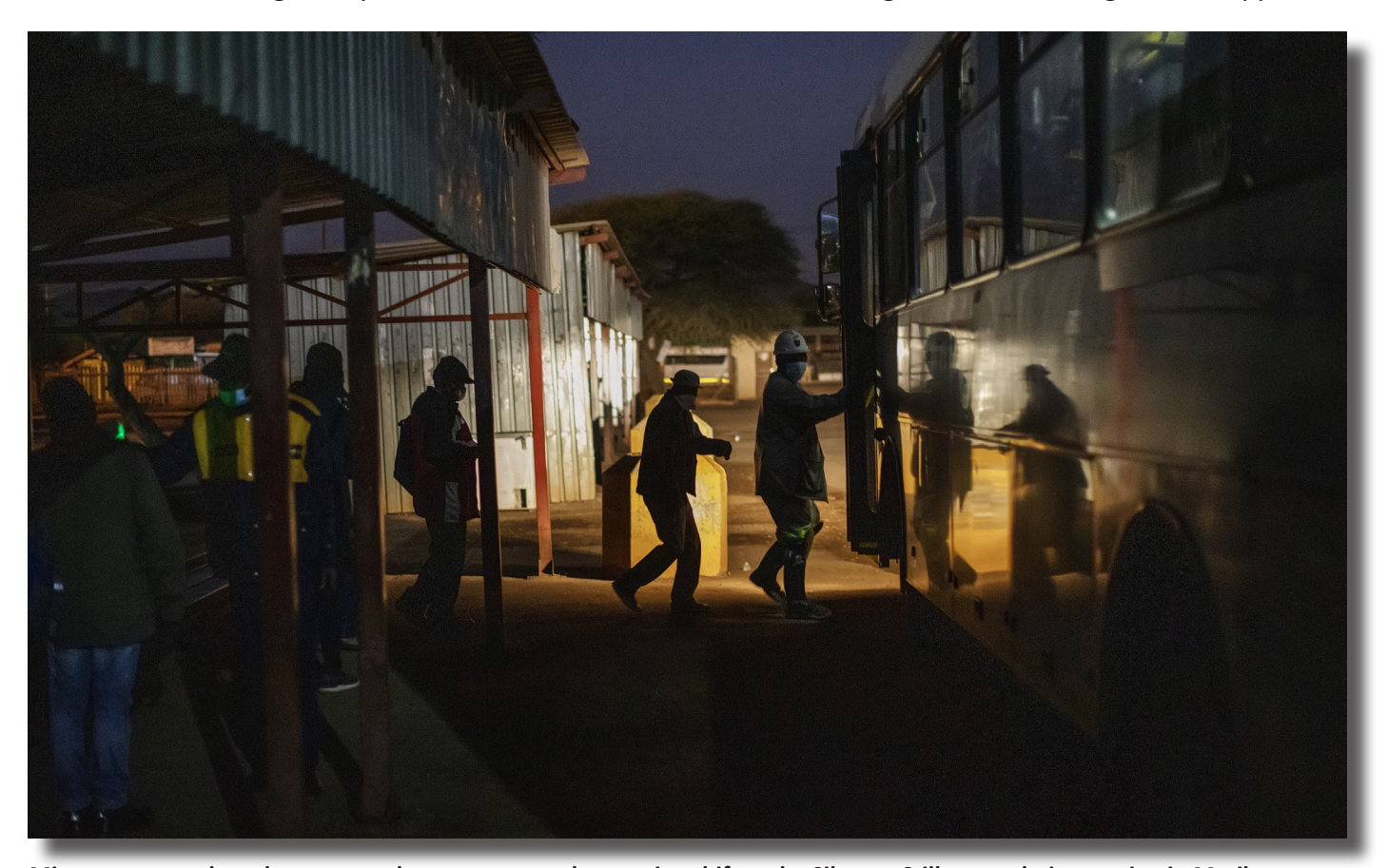
Miners queue to board a company bus en route to the evening shift at the Sibanye-Stillwater platinum mine in Marikana, Rustenburg, on May 15, 2020 after having had their temperature checked.

Mining and oil and gas companies have primarily been concerned about containing the spread of the virus within their operations. As global lockdowns start to ease in the aftermath of peak death rates having been reached, but with COVID-19 likely to be a prominent part of the near to medium term future, they will have to define new strategies of production and find new means of sourcing or manufacturing critical supplies.