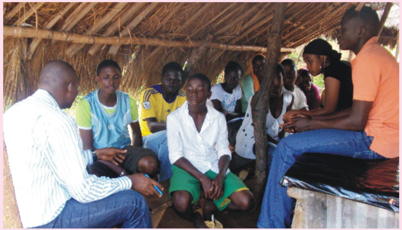
Members of the trained Peer Educators and CPED project team reviewing plan of action for the implementation of youth friendly services

Suffice to state, other extraneous variables such as spiritual homes, witchcraft, myths have come into play to confuse the people of the female folks from attending modern health facilities where available and also there is the lack of adequate health facilities in the rural areas to attend to those in need during emergencies.