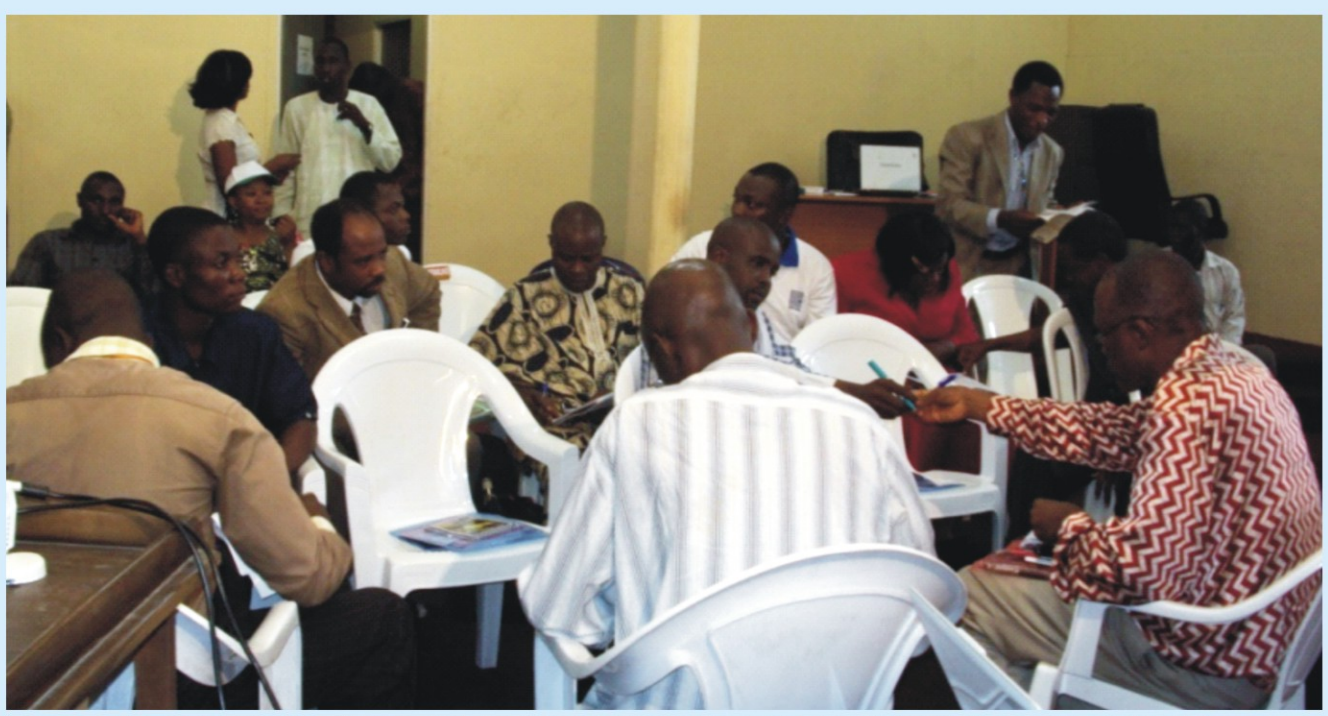
Interactive session by workshop participants to brainstorm on the sexual reproductive health challenges in Edo State