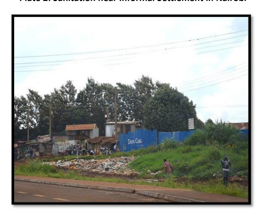
Plate 2: Sanitation near Informal Settlement in Nairobi