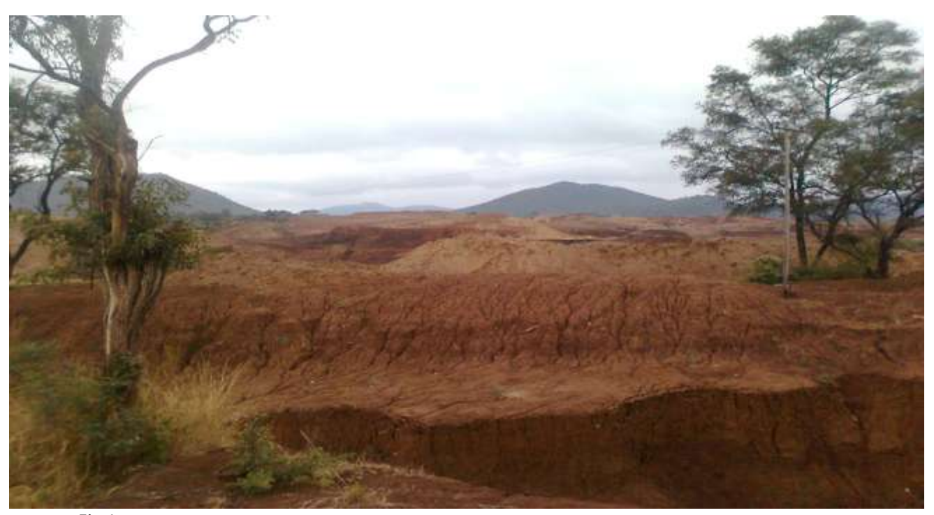
Fig 1: Large scale environmental degradation at DTZ premium mining site yet to be rehabilitated

Selective application of law in this mining venture has made it difficult for EMA to control small scale artisanal mining activities taking place in Penhalonga. Penhalonga residents find no reason why they should not be allowed to pan when a foreign mining giant is mining in Mutare river against the law at the same time the company has not made any significant contribution to the development of their community. Infrastructure in Penhalonga including roads and bridges is in dilapidated state. The following pictures illustrate the scale of environmental damages caused by alluvial gold mining in Penhalonga.