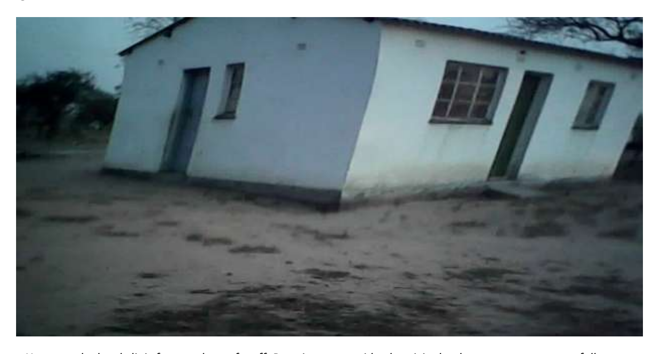
House at the local clinic for members of staff. Promises to provide electricity by the company were not fully met

The company embarked on electrifying the nearby school and clinic when it started mining operations in 2011 but the project was eventually abandoned. Request for the company to erect boreholes and build an irrigation scheme for the community in order to undertake a sustainable agricultural project has been ignored.