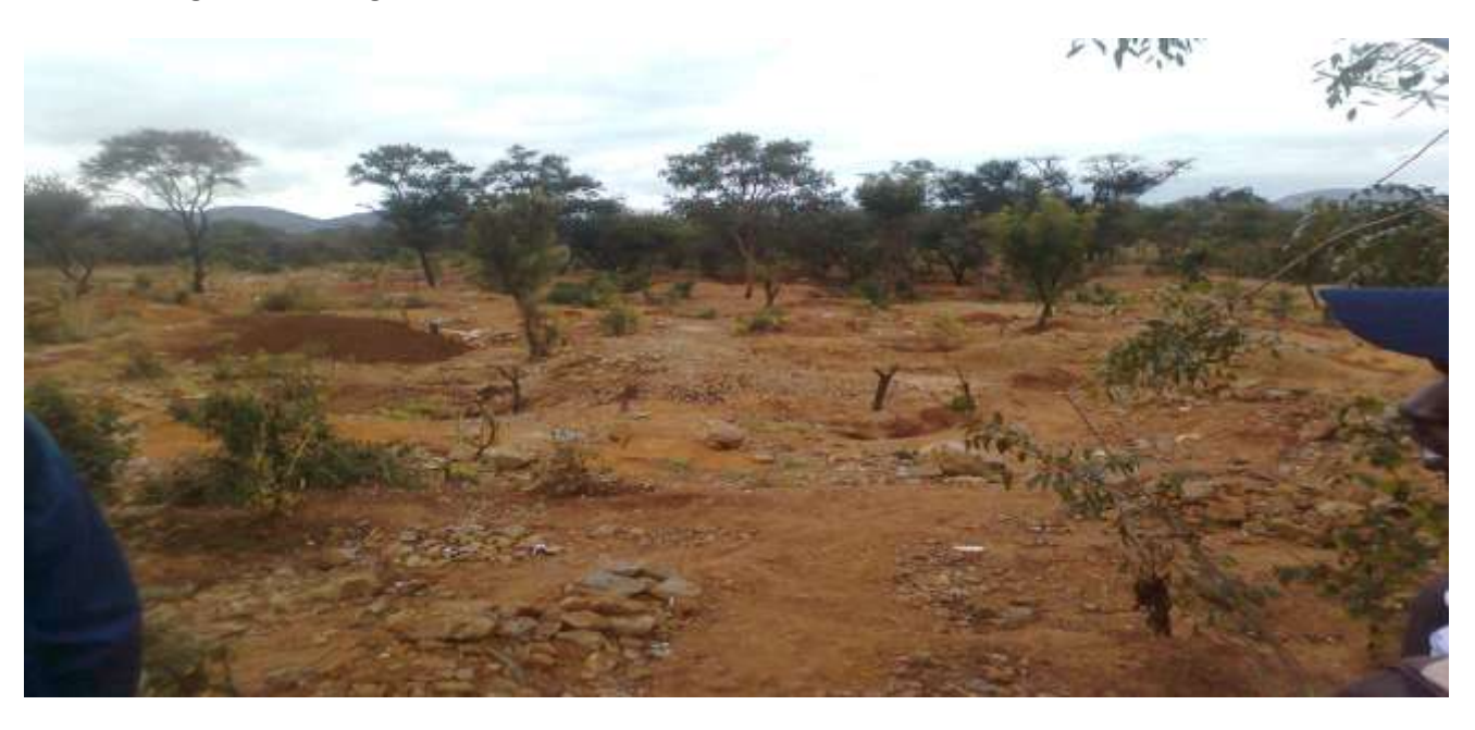
Panning site at Premier site in Penhalonga