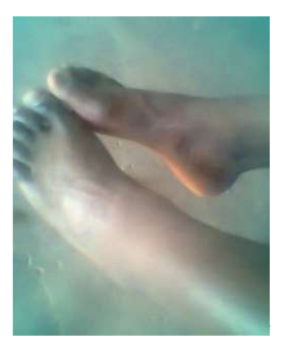
Towanda's severed feet