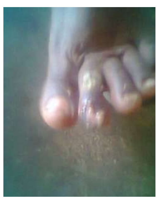
Clemence's dislocated toe from dog bites