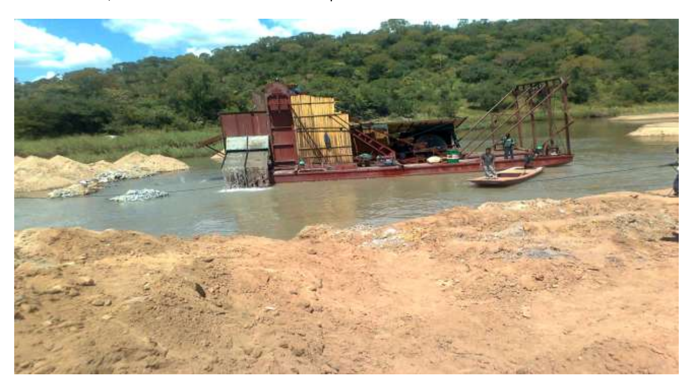
Rare boat mining equipment used by Linefall to illegally extract gold in Odzi River

The following pictures are of Chinese mining companies namely Linefall investments and Kingfrost gold mining companies who mined alluvial gold in Odzi River for over 6 months in 2013 without both water permits and approved EIA plans. Although the mining operations here were eventually stopped, nothing could be done to reverse the scale of ecological damage more so the plundering of the gold resource without any contribution to the development of the community at Odzi, who were exposed to polluted water and degraded pastoral land as a result of the mining activities. Mining operations at Odzi reflect on the weaknesses of the mines and minerals act that give room for individuals and companies to carry out mining activities without clearance from other important stakeholders like communities, rural district councils, EMA and ZINWA with disastrous impacts to communities and the environment.