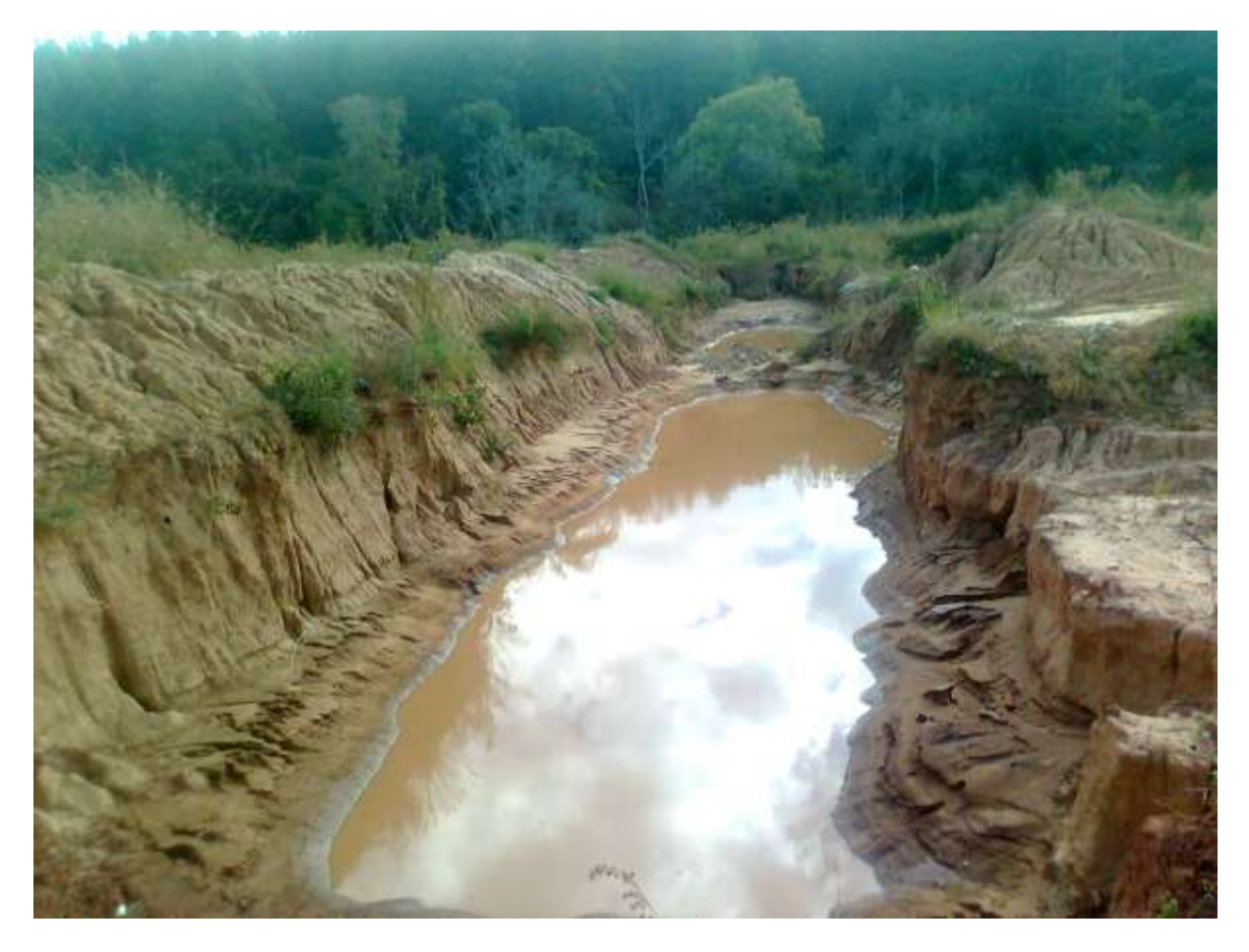
Pits left by a Chinese company that was mining alluvial gold in Nyamukwarara without legal documents

People and livestock in Odzi and Arda Transau have suffered the downstream effects of these mining activities because they dumped hazardous substances and sludge into Odzi River. Odzi river is the source of water for surrounding communities including about 4 500 relocated people at Arda Transau. Unscrupulous mining activities has increased siltation and death of water bodies amid reports of livestock dying after drinking contaminated water from these river sources.