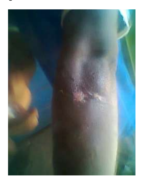
Edmore's healing dog bite wound.