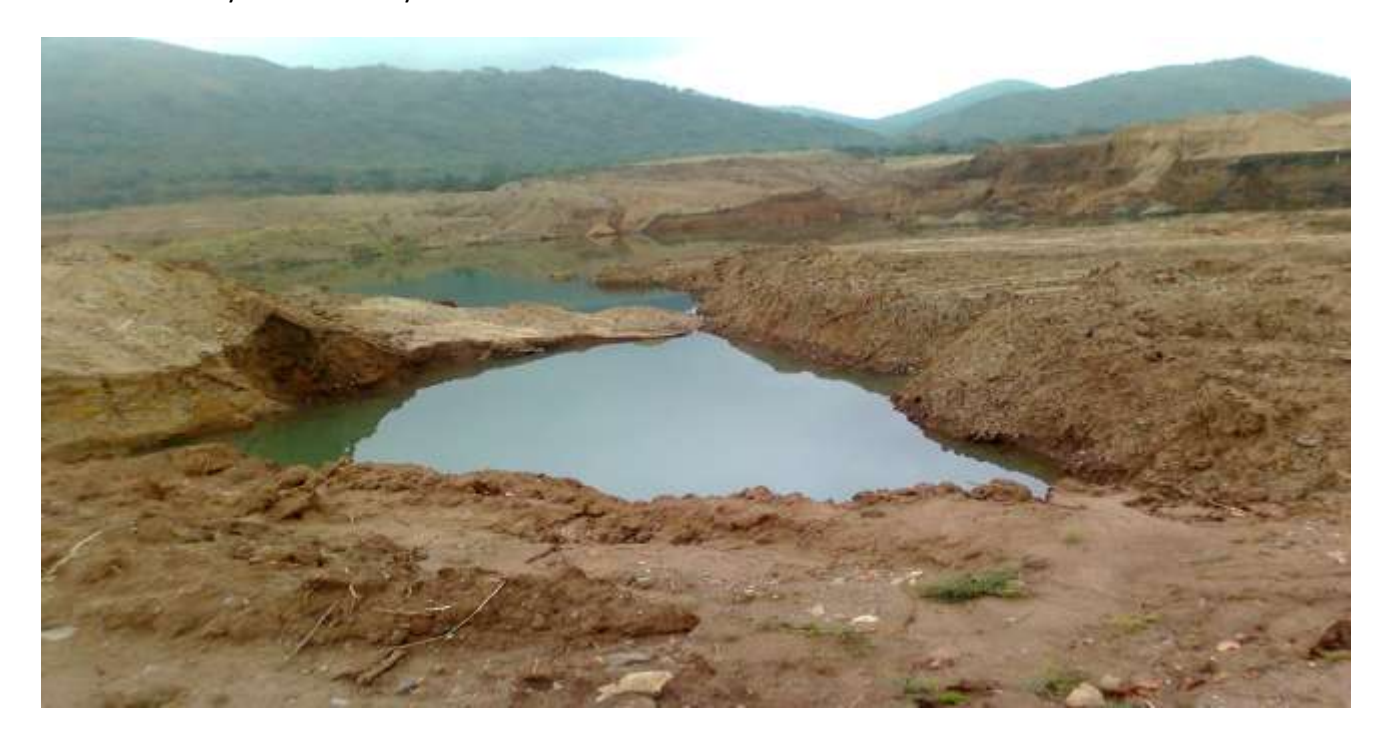
Fig 3: Impoundments affects natural flow of water

Alluvial mining in the river disturb the water source through sediment release and construction of impoundments that affect natural flow of river. This mining method destroy the riverine ecosystem and aesthetic beauty of the countryside.