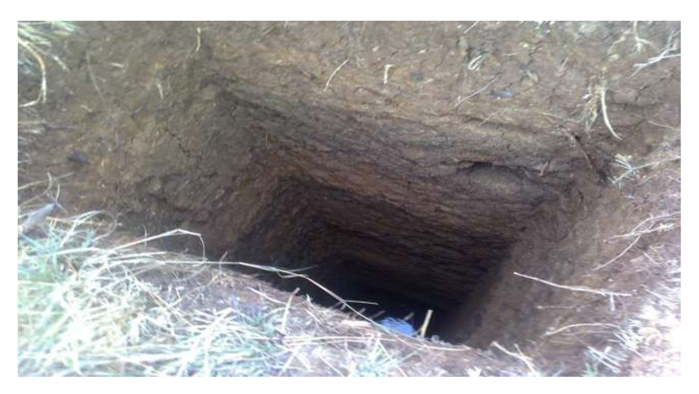
Deep holes left by panning activities in Penhalonga