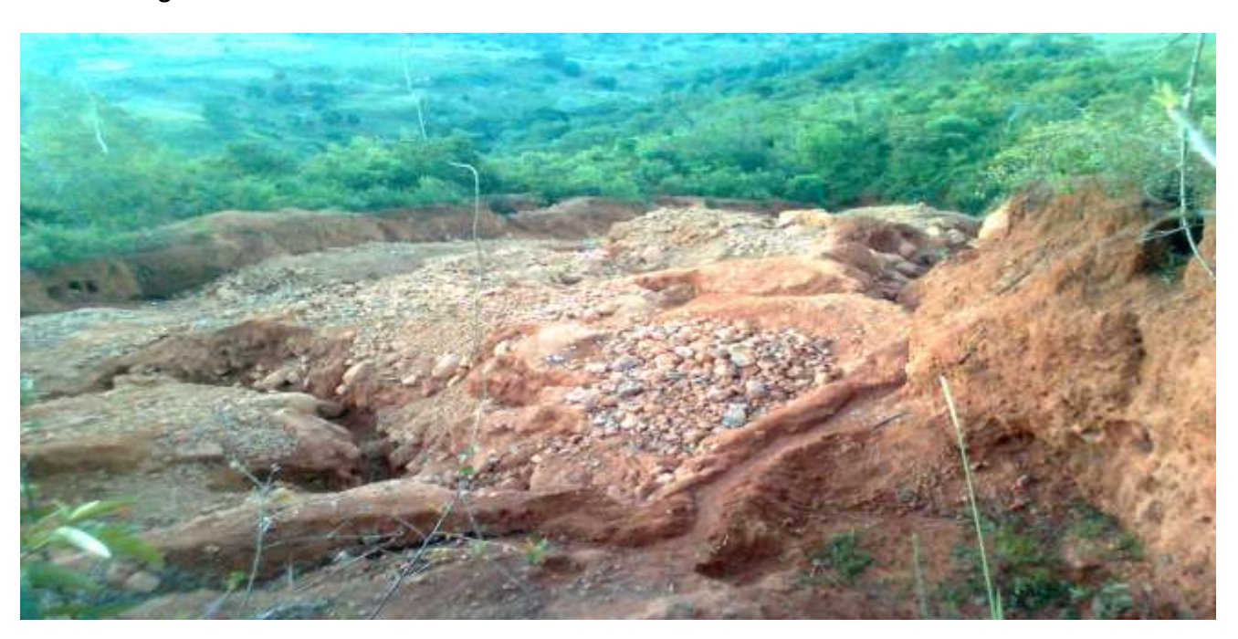
Chimanimani panning site in the catchment of Nyabamba River near Ross Commons Tea Estate