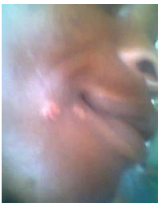
Challington's dog bite injuries