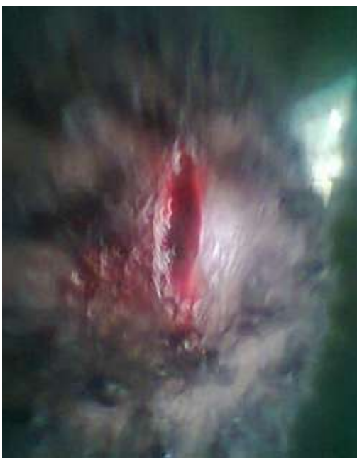
Tawanda'head injury from a gruesome attack