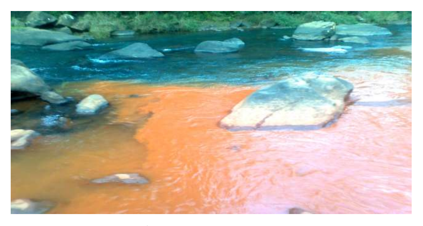
Mud water from Nyabamba river polluting Nyahode River