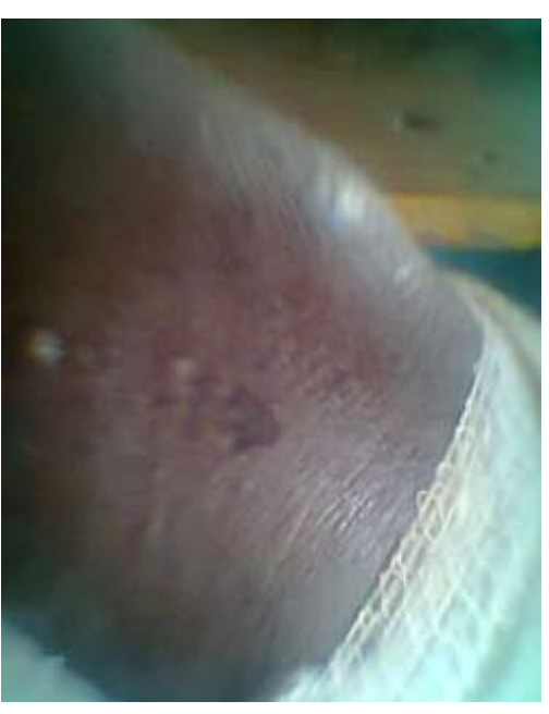
some of Evian's dogbite injuries.