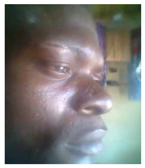
Hardlife was beaten by National Eye Security guards