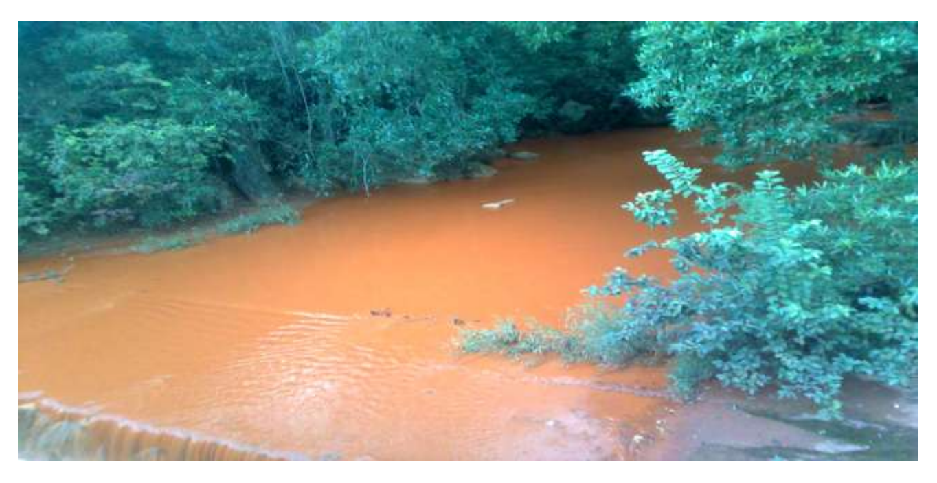
Muddy Nyabamba river caused by panning upstream in Chimanimani