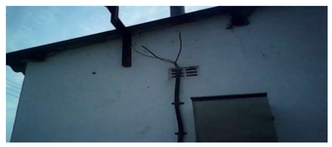
Abandoned electrification project that was started by Bayrich Enterprises in 2011 for Madzivire Primary school