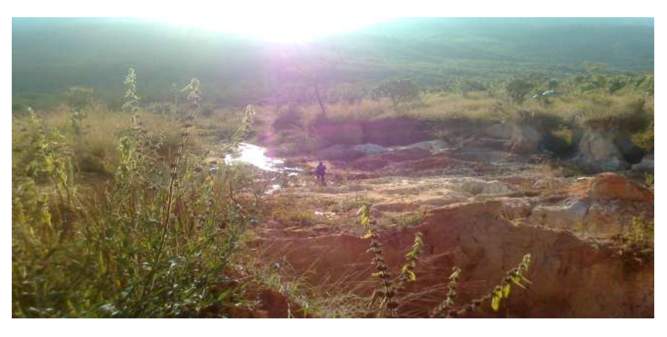
Alluvial gold panning stream Zimbabwean side Nyamukwarira