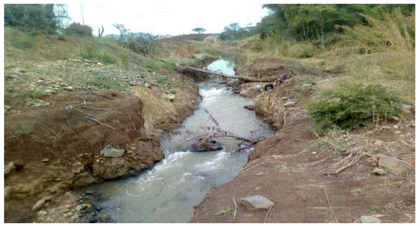
Fig 2: Diverted Mutare River at DTZ Premier Estate

Alluvial mining in the river disturb the water source through sediment release and construction of impoundments that affect natural flow of river. This mining method destroy the riverine ecosystem and aesthetic beauty of the countryside.