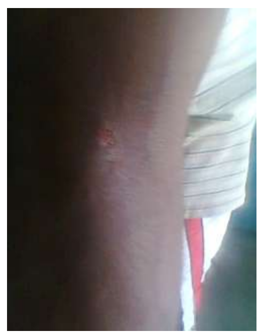
Jacob recovering from dogbite injuries and beatings