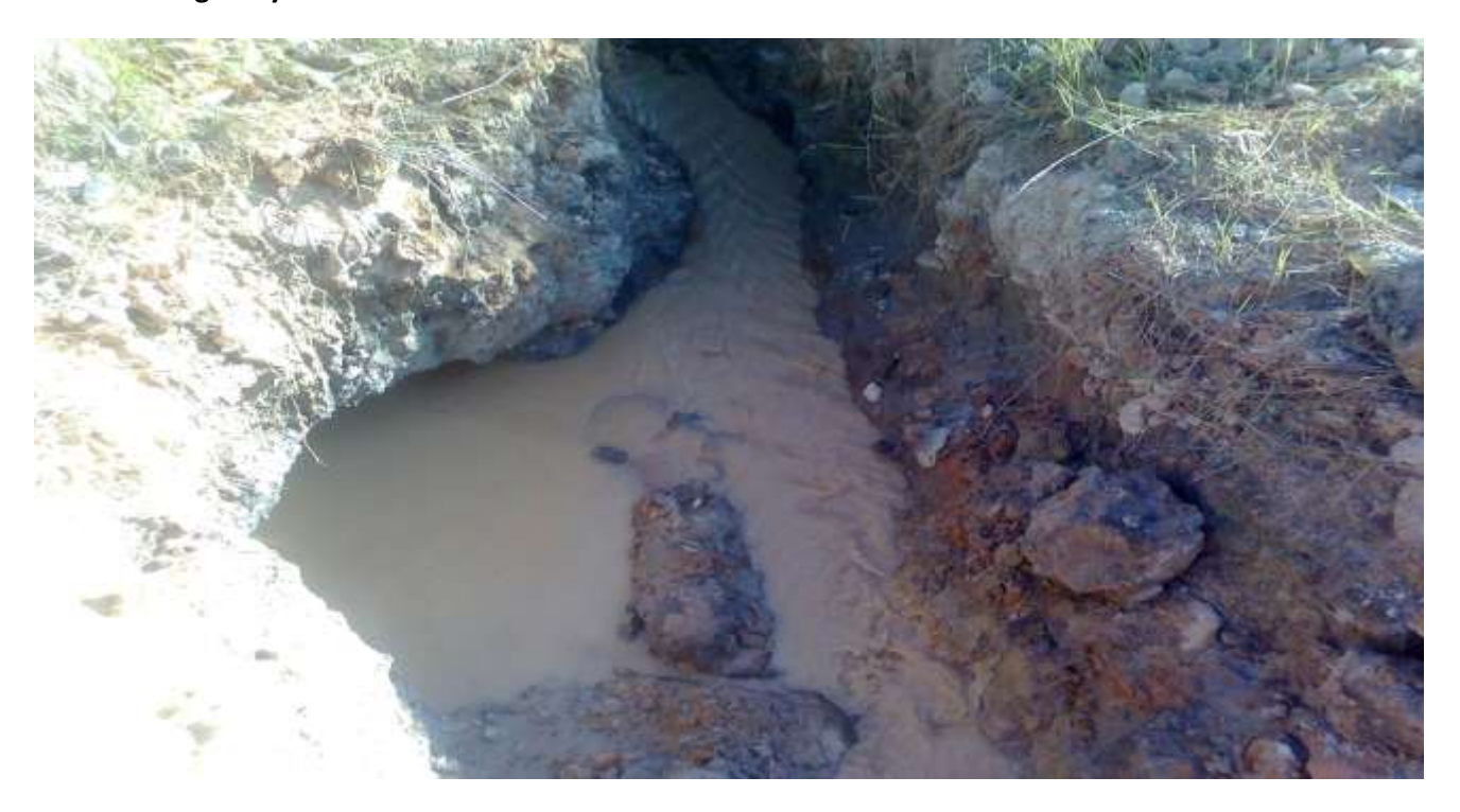
Muddy flowing stream caused by panners in Nyamukwarara