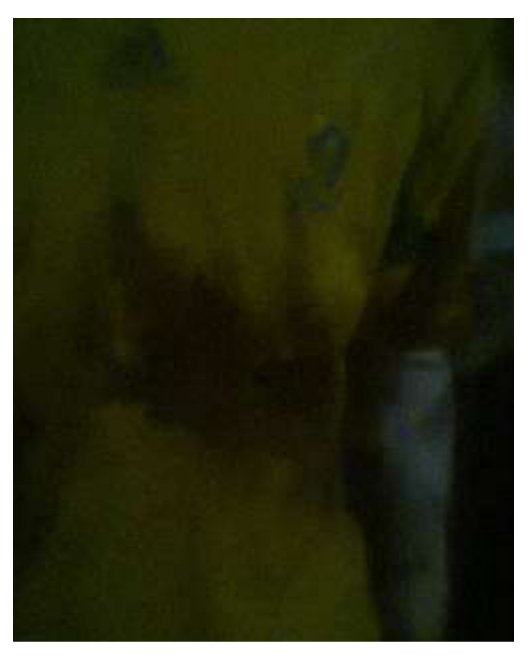
Quesdisani's bandaged hand and shirt with blood stains