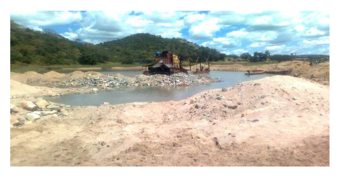
River damages caused by linefall illegal mining activities at Odzi