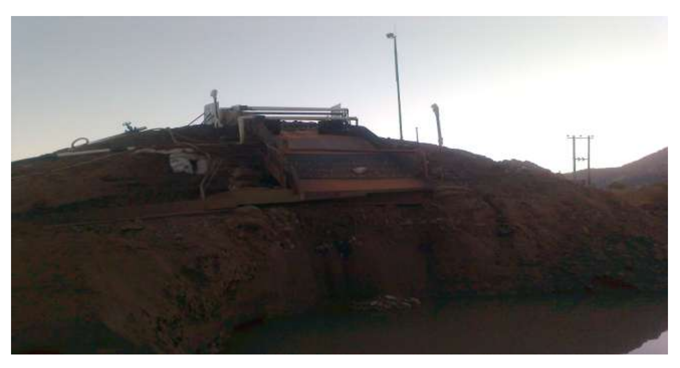
.Concealed alluvial gold processing plant at Kingfrost illegal gold mining in Odzi