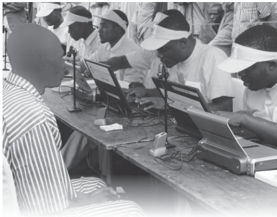
Prisoners being registered to vote