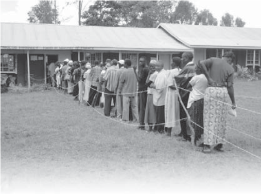
Citizens at a polling station