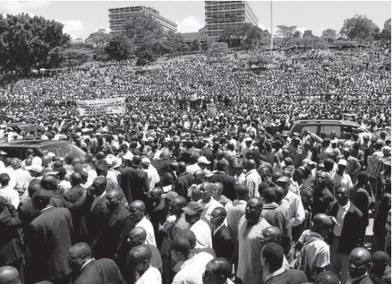
A campaign rally in progress