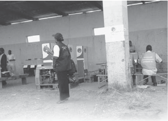
EISA observers on an Election observation mission