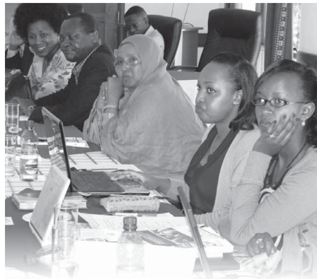
Some of the participants at the IEBC Bill development forum