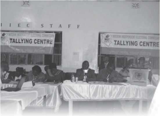
Election officials at work