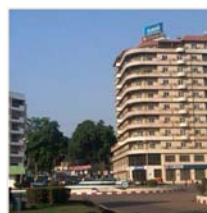
The central town of Bangui

The country has been unstable since its independence from France in August 1960 and is one of the poorest and least developed nations in the world (eighteen of the poorest countries by GDP per capita are in