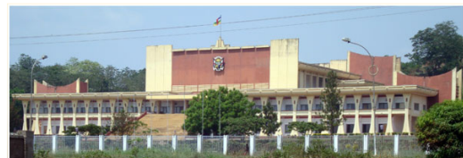
National Assembly Building, also home to the CEI offices

The unicameral Parliament is composed of 105 members, elected by direct universal suffrage to serve five-year terms, using the two-round system. In this system, if no candidate has an outright majority in the first round, a run-off is organised for all candidates who have secured at least 10% of the votes. The candidate who garners the highest number of votes is proclaimed winner in the constituency.