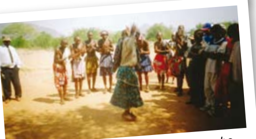
Open community meeting in Kapangombe, Namibe province

Soldiers during impact survey, 21<sup>st</sup> Battallion, Matala, Angola