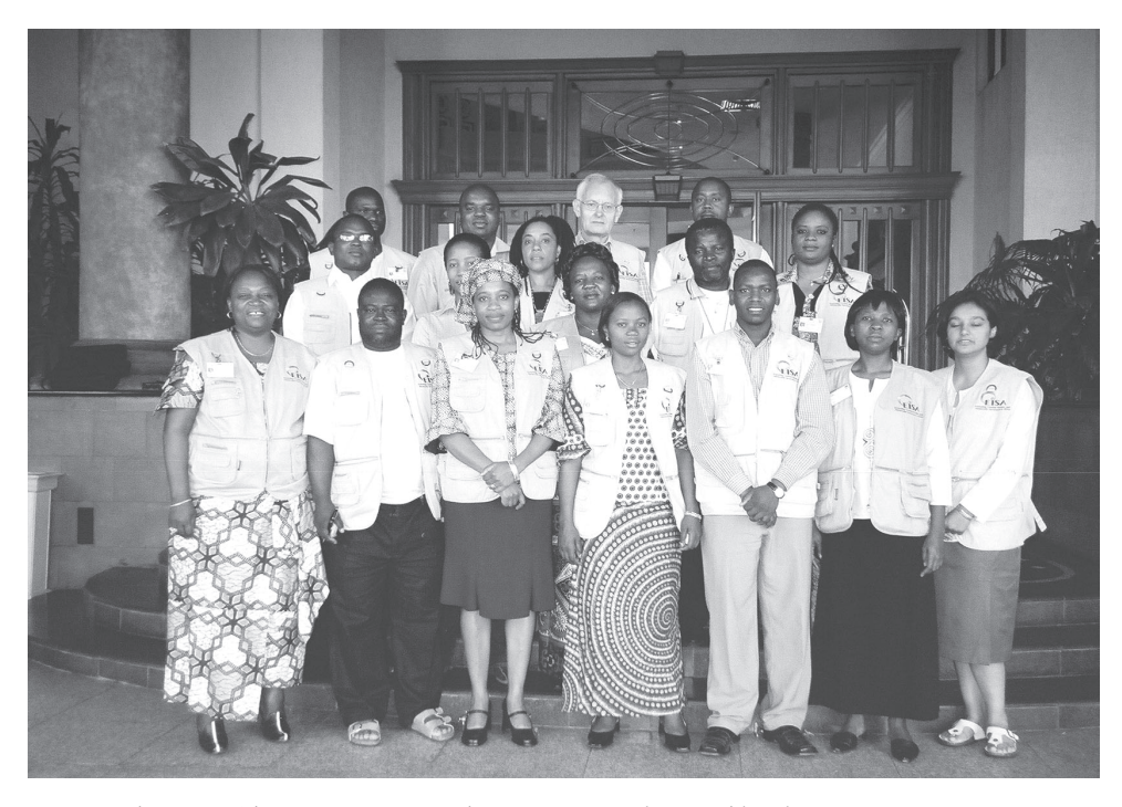
The EISA Observer Mission to the 2005 National Assembly Elections in Mauritius