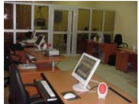
The Information Communication Technology unit of NIIA

These recent technological achievements have brought the NIIA to the modern frontiers of ICT-enabled work platform for performance enhancement and efficient information service delivery.