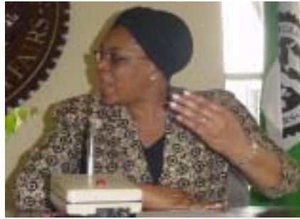
Prof. U.Joy Ogwu (OFR) presenting her paper during the International Conference