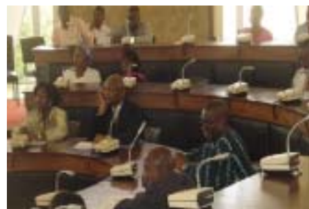
A cross-section of the audience at the NIIA Departmental seminar in Lagos