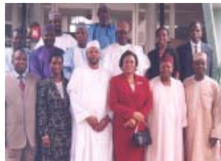
A group photograph of the members of the NIIA Governing Council