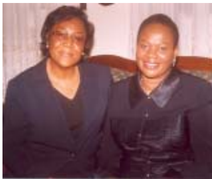
Prof. U. Joy Ogwu and Prof. Dora Akunyili, DG NAFDAC during her visit to NIIA