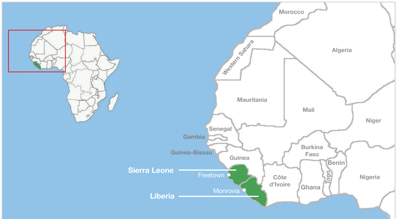
Map 1: Liberia and Sierra Leone

including women and youth, to build pathways to peace. The report emphasises the need for local ownership and to engage local actors. It promotes the idea of sustaining peace by making grievances, as drivers of conflict, central to the analysis of conflict. These grievances are formed through horizontal inequalities between different population groups on the basis of identity, region and political inclusion. 7