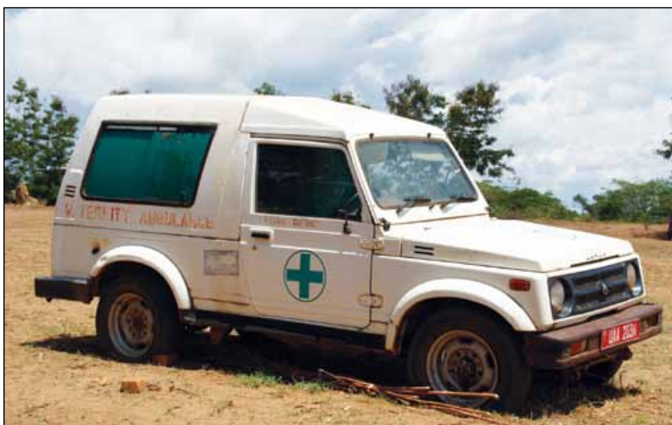
Maternity ambulance going nowhere

The fieldwork process revealed that the poor state of health infrastructures play a major role in a sense of despair and fear that pervades communities. Basic resources, and fears related to dwindling water supplies, also often entered discussions. In the case of