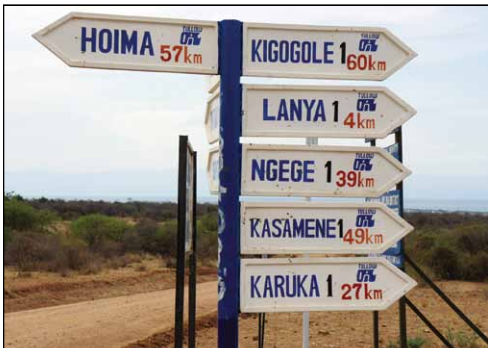
Tullow Oil signpost on Hoima-Buliisa road

When the topic of oil developments came up for discussion, the Bunyoro elder pointed out that given its political marginalisation, the kingdom has not at any stage been consulted about oil developments taking place in its region. He noted that: 'They