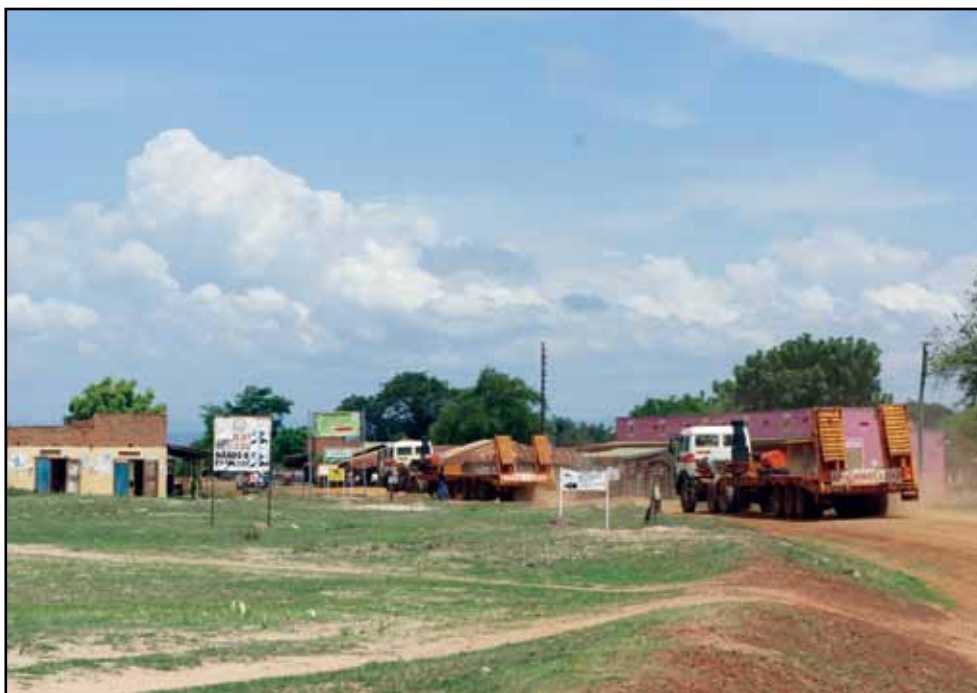
Trucks passing through Buliisa

meetings attended in the course of the fieldwork. Land in the Buliisa area is owned communally, 57 and residents therefore do not have title deeds to prove ownership. As a result, speculators have exploited this situation to access portions of land via local contacts. The community is worried that their traditional lands may be lost owing to their inability to prove ownership. The CBO representative also claimed that powerful individuals with political connections have been manipulating the land tenure situation in Buliisa. In response to this manipulation, President Museveni has imposed a moratorium on the processing of any land titles in the Buliisa area, and has ordered an investigation into shady land transactions that have already been concluded. 58