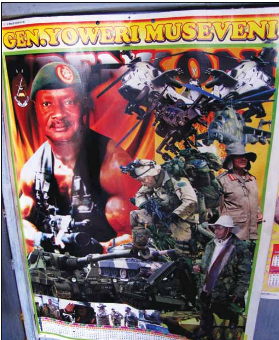
Poster of President Museveni on a Kampala street

As military strongman, Museveni has proven himself to be an effective guerrilla who fought for, and obtained, political power through the barrel of a gun. Yet after assuming responsibility as head of state, he systematically battled seven armed guerrilla movements that challenged his and the Ugandan state's authority since 1986.