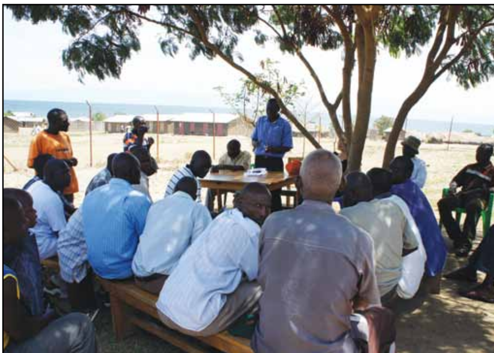
Publish What You Pay meeting, Ssebagoro

The CBO representative from Buliisa indicated that there is a solution to the problem of communal land ownership. Communities without title deeds have begun to organise communal land owners' associations. These associations document all the people living in a village or area owned communally, and then register the land in their names. 65 However, NAVODA has stated that the cost of registering land is too high, at an estimated UGX 66 3 million (approximately $1,300), 67 and makes poor subsistence farmers and fishermen unable to afford this.