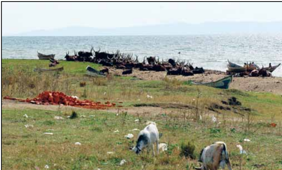
Signs of subsistence economics in the form of cattle, goats and fishing boats on the shore of Lake Albert, Tonya

Ancestral memory of life on the shore of Lake Albert stretches back for generations. This became clear during an interview with a LOCI representative. She described in some detail how ‘... my parents, grandparents, and too many generations to remember, all lived in this village.’ 92 She illustrated that although life on the lake may be tough, these are ancestral lands and the oil exploration activities have upset traditional economic practice. She said that the generations that precede her and her children ‘... all lived off the lake.’ 93 The lake is therefore much more than a static body of water for the people in Kaiso-Tonya. It is an integral part of ancestral memory while also providing the economic basis for survival. To make matters worse, she indicated that since the seismic studies were conducted in the vicinity of their village, fishermen have complained about dwindling catches. These complaints were echoed by several fishermen during the course of the fieldwork, who thought the seismic studies may have interfered with the fish breeding grounds, or the fish were scared off by the explosions and migrated to other parts of the lake. 94 Others, however, did not see a direct link between the seismic studies and dwindling fish stocks.