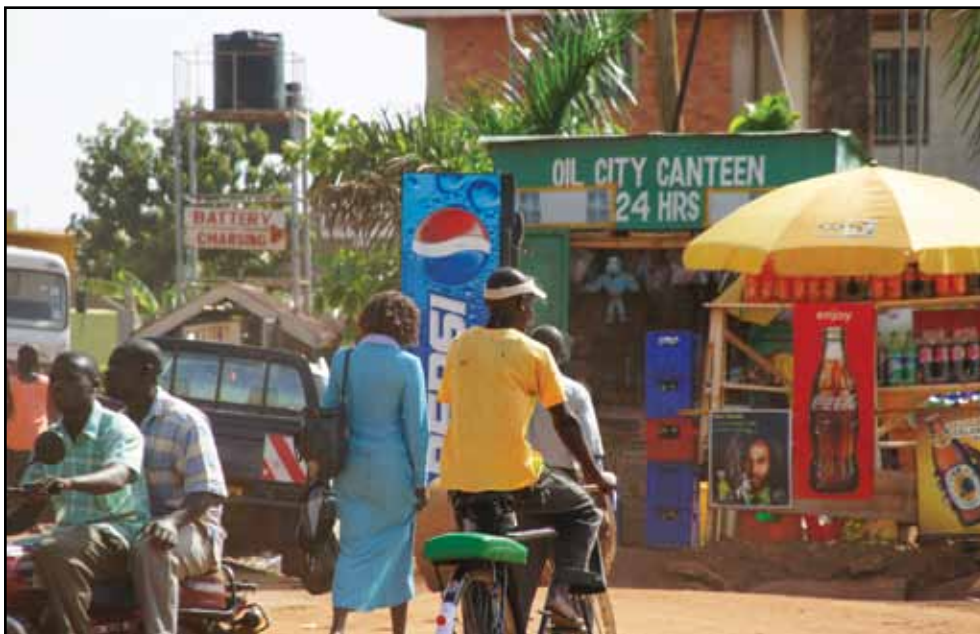
Street scene from Hoima (Oil City), Western Uganda

Hoima, a medium-sized town in western Uganda, has become the focal point of the country's oil industry in the past five years. By car, Hoima is about a two-to-three hour journey when travelling from Kampala. The well-maintained tarred road snakes through Busunju, Lunya, Kiboga and several other small villages along the way. At Hoima, the tarred roads fizzle out and a network of treacherous gravel roads begins that runs towards Lake Albert and Uganda's western border with the DRC. In the Bunyoro language, Lake Albert is known as Lake Mwitanzige. Local perception of Hoima has changed dramatically in the past few years. Inspired by oil discoveries, a local radio station, Spice FM, started calling Hoima 'Oil City'.