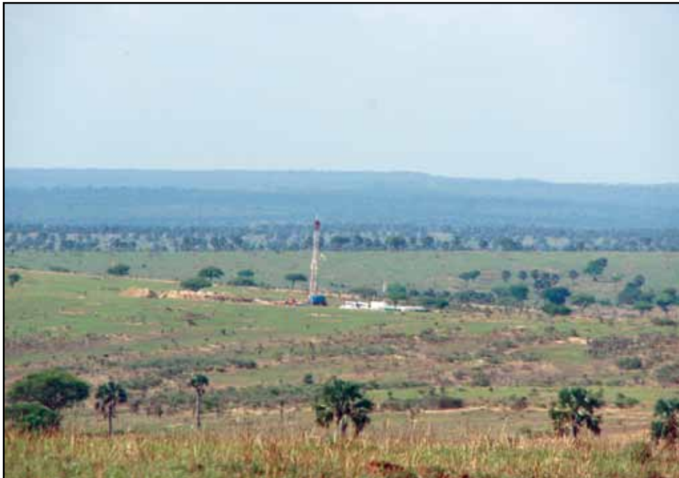
Oil drilling operation in Murchison Falls National Park

Political marginalisation takes many forms, and is shaped by particular sets of historical, political, social and economic relations. In the earlier section discussing the perspective on oil from the Bunyoro Kingdom, some statements emerged that have sobering implications. The Bunyoro elder complained about government ignoring requests by the kingdom to benefit from the oil found in their territory. The recent frustrations regarding oil exploration in the region should be viewed in the context of a much longer