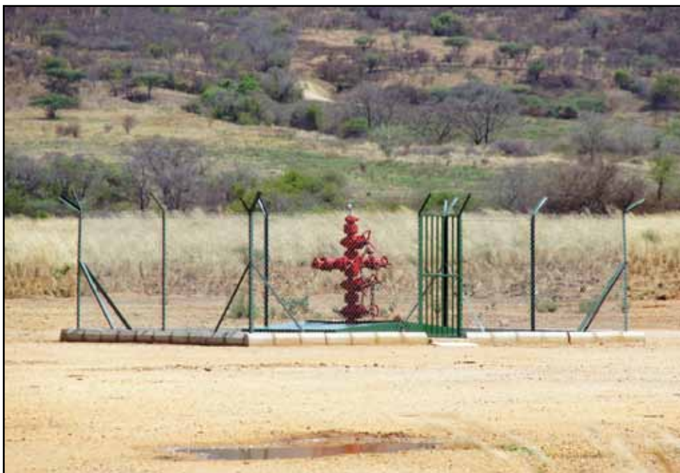
Oil well close to the village and shore of Lake Albert

The CBO representative from Buliisa expressed his disapproval of oil exploration activities taking place in the Murchison Falls National Park. He noted that villagers in Buliisa complain bitterly about the daily traffic of heavy trucks that pass through town. These churn up continuous clouds of dust, and he is concerned that similar traffic in the park is not only upsetting the environment, but also having a negative impact on animal life. In addition to the experience of being shrouded in dust clouds, the CBO representative accused government and Tullow Oil of not being transparent about findings of environmental impact assessment (EIA) studies devoted to the impact oil exploration stands to have on the area. 102 He said that: ‘We are also worried about the possible impact oil spills can have on the lake and the park.’ 103