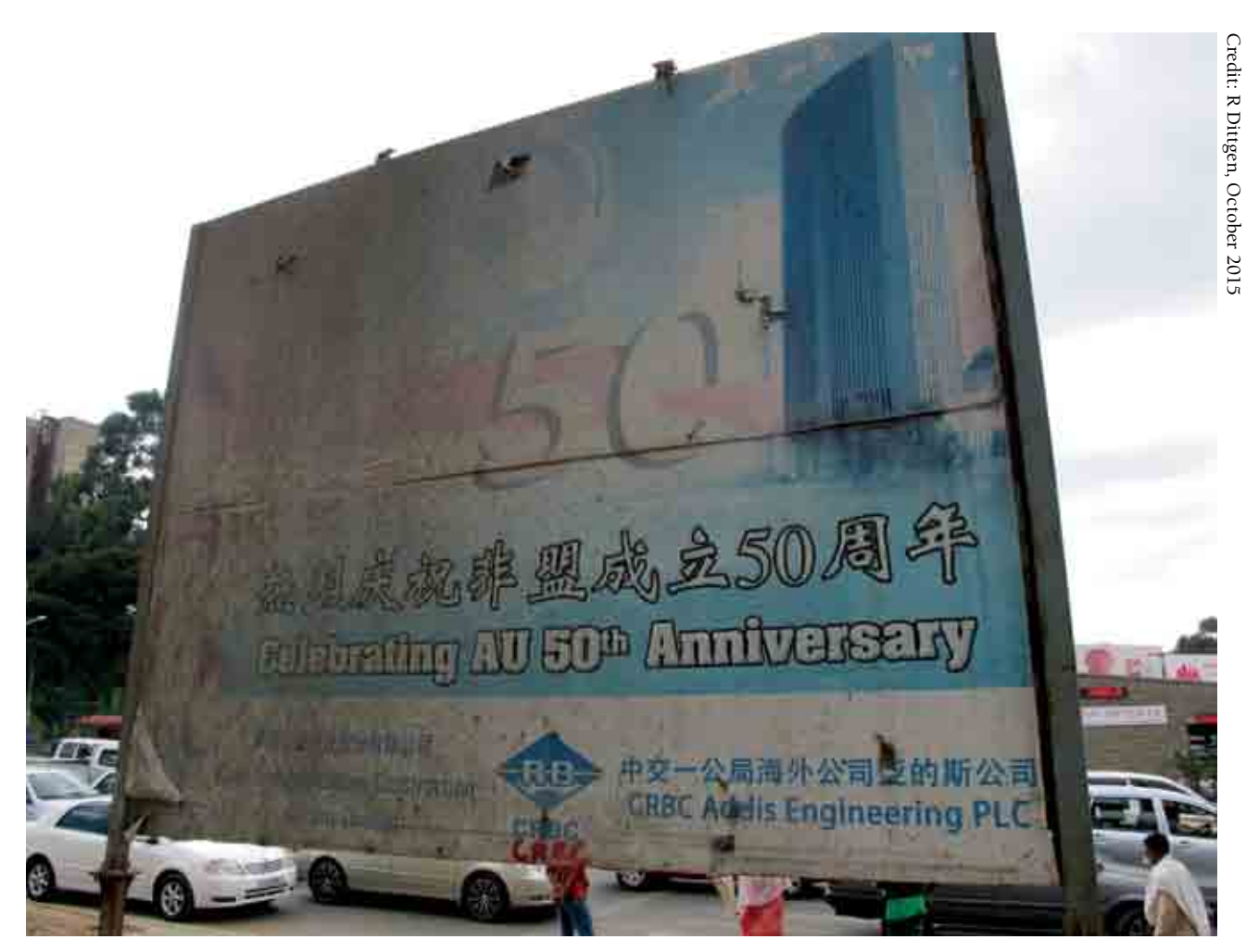
A Chinese billboard celebrating [the] AU's fiftieth anniversary, Addis Ababa

Salini was awarded the actual construction contract for the dam.<sup>77</sup> The Industrial and Commercial Bank of China is believed to cover 85% of the $495 million project (through a loan). Additionally, China Eximbank is financially supporting the realisation of high voltage transmission lines to Addis Ababa to be implemented by another Chinese company. More recently, Chinese operators have also been awarded the contract to build the power transmission lines for the Grand Renaissance Dam on the Blue Nile River.