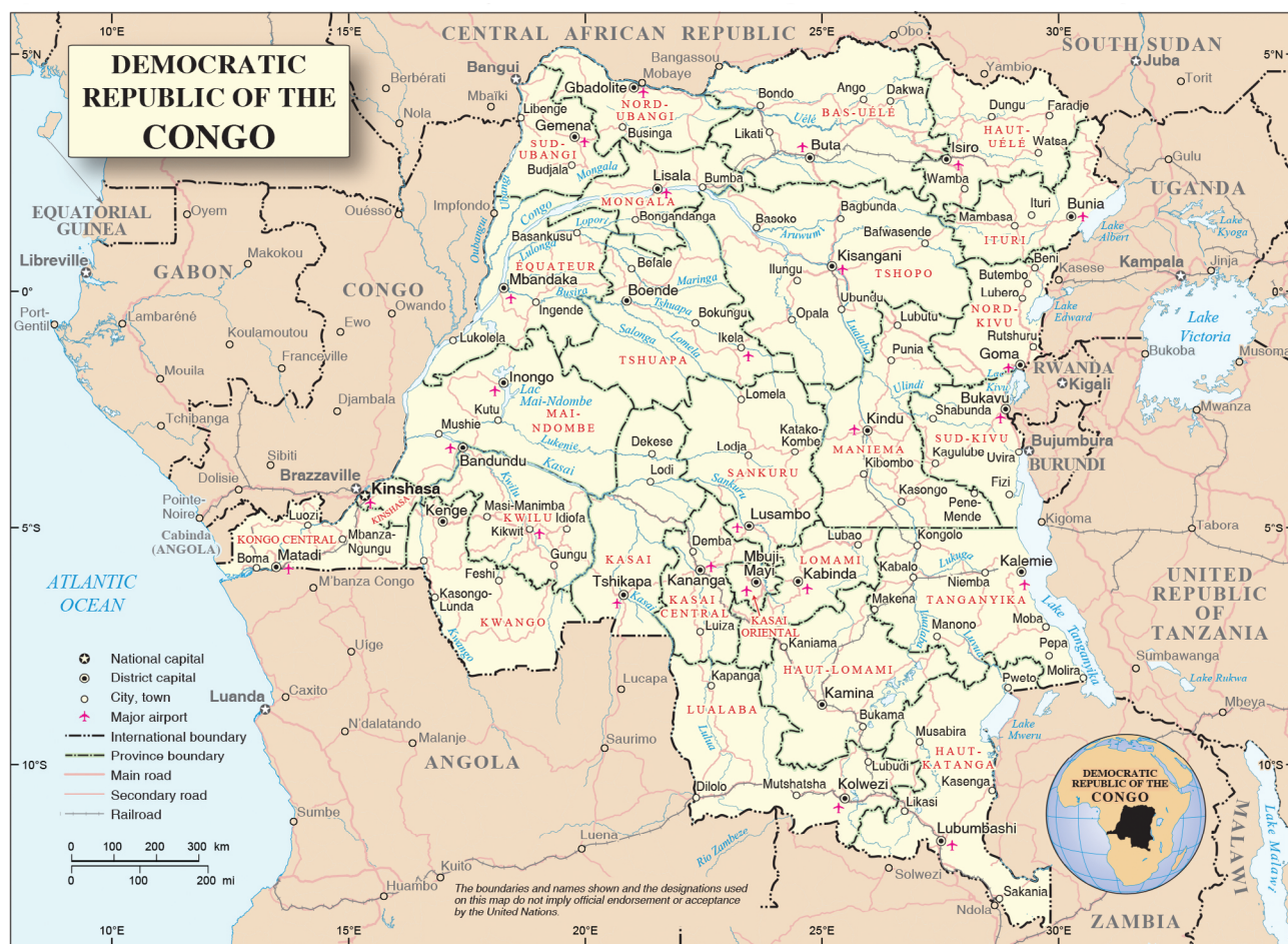
FIGURE 1 MAP OF THE DRC

Map No. 4007 Rev. 11 UNITED NATIONS May 2016