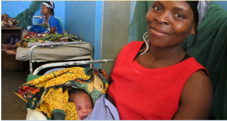
A mother and her newborn child in the maternity ward at Nangalamu Health Center, Malawi.