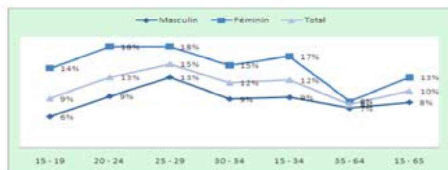
Table 3: Evolution of the unemployment rate based on the age group and sex