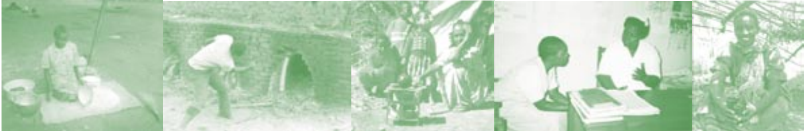
image and self confidence and ensuring that they have access to fora in which they can express themselves help to challenge DSD.

• Transformation of the gendered nature of DSD is a critical precondition for empowering women living with HIV/ AIDS.