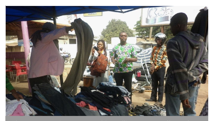
The woman is engaged in selling secondhand clothes and shoes in the neighborhood of Tokoin-Wuiti.

In order to provide social protection to those not in the formal sector, Act No. 2011-006 was adopted by the Togolese National Assembly in February 2011 to provide social security to three particular sectors of the economy. These sectors include those who are selfemployed, working in the informal economy, students of vocational schools, apprentices, and trainees.