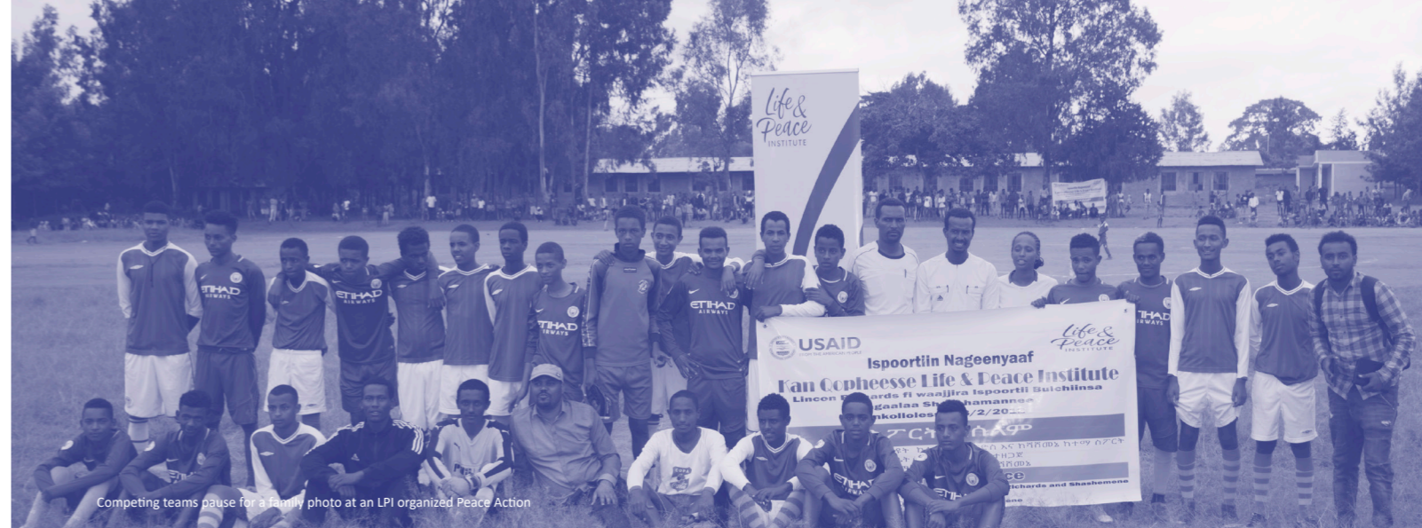
Competing teams pause for a family photo at an LPI organized Peace Action