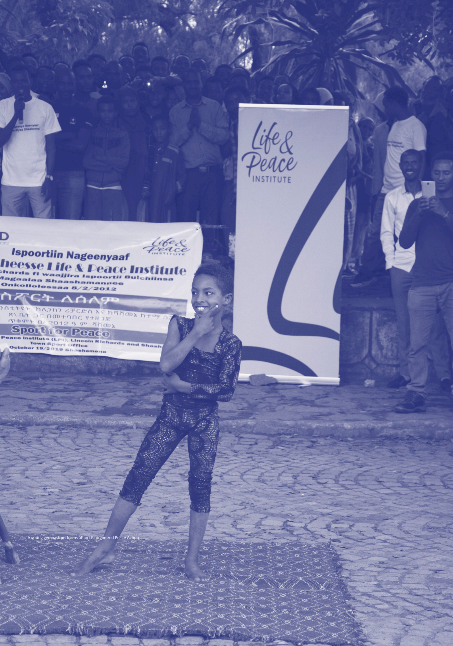
A young gymnast performs at an LPI organized Peace Action