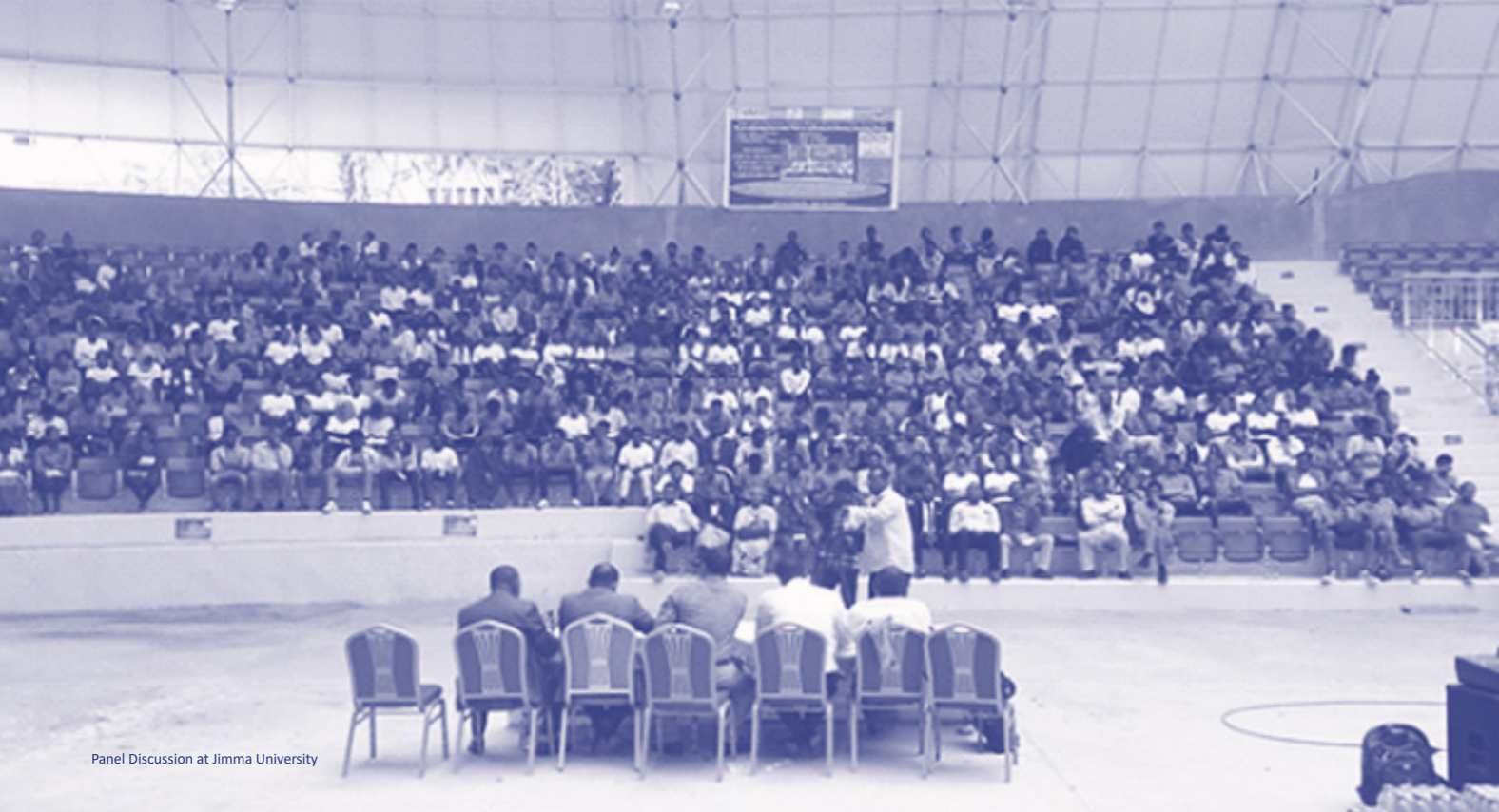
Panel Discussion at Jimma University