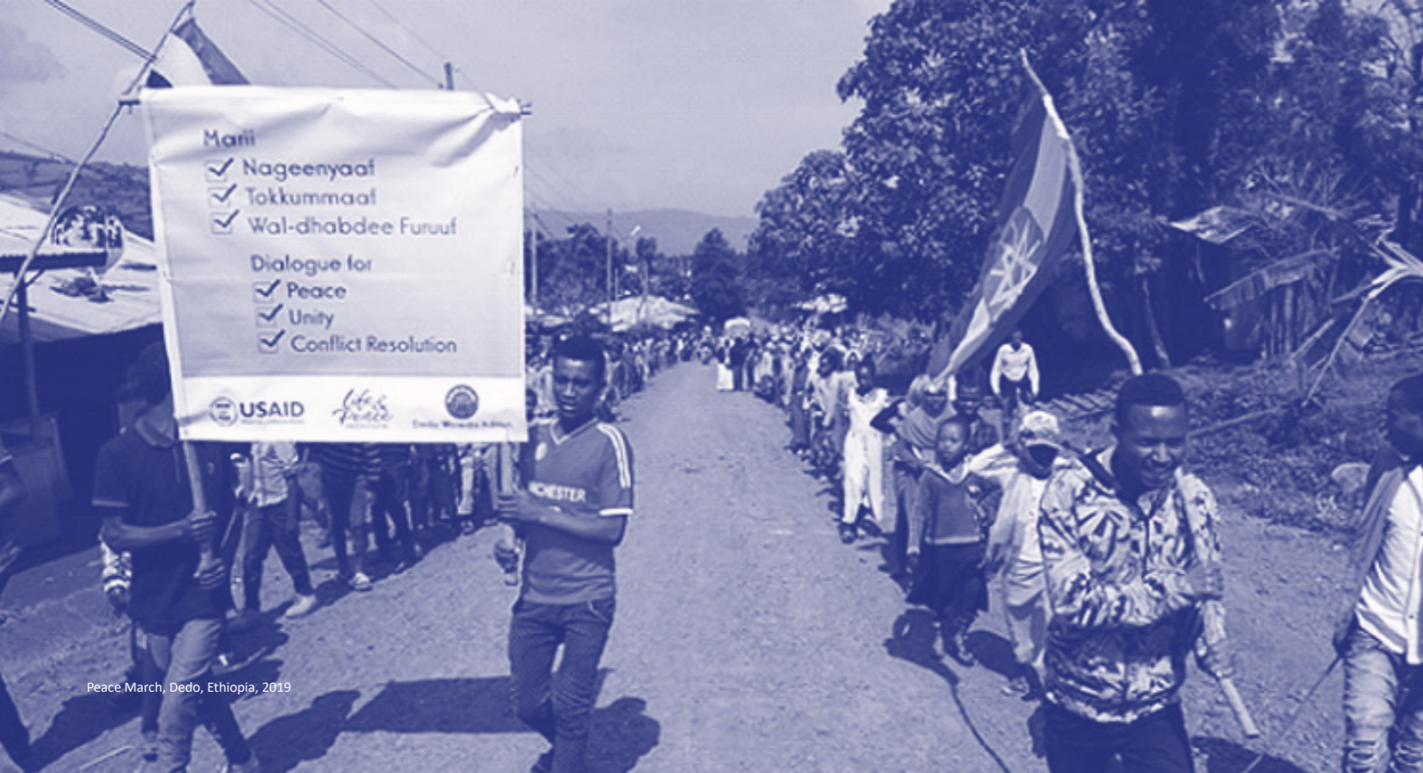
Peace March, Dedo, Ethiopia, 2019