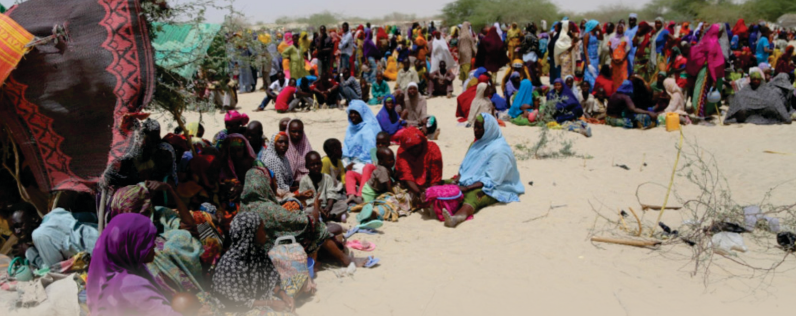
Thousands of people, mainly women and children, are scattered across the arid land of Nguigimi, Niger, after fleeing Boko Haram violence in Nigeria.

In Nigeria, Boko Haram continues to wage a deadly campaign with huge humanitarian costs. Whereas in Somalia, the activities of the al-Shabab is a growing source of concern. Insurgency perpetrated by extremists with Islamic State allegiances in Mozambique's isolated northern regions where over the past two years, more than 200,000 people have been displaced with 900 deaths is also becoming worrying. These threats are transnational and have the potential to be exported to Europe and the U.S. Additionally, with the varied U.S. interests in Africa, partnering Africa and enhancing capacities to keep Africa safe is also good for U.S. interests. U.S. leadership through the Security Council in supporting robust interventions in troubled spots is very much appreciated and could be accelerated. Support for democratic principles on the continent will help in the long run considering current trends of democratic reversals and the potential instability that will be generated in the next 5 to 10 years.