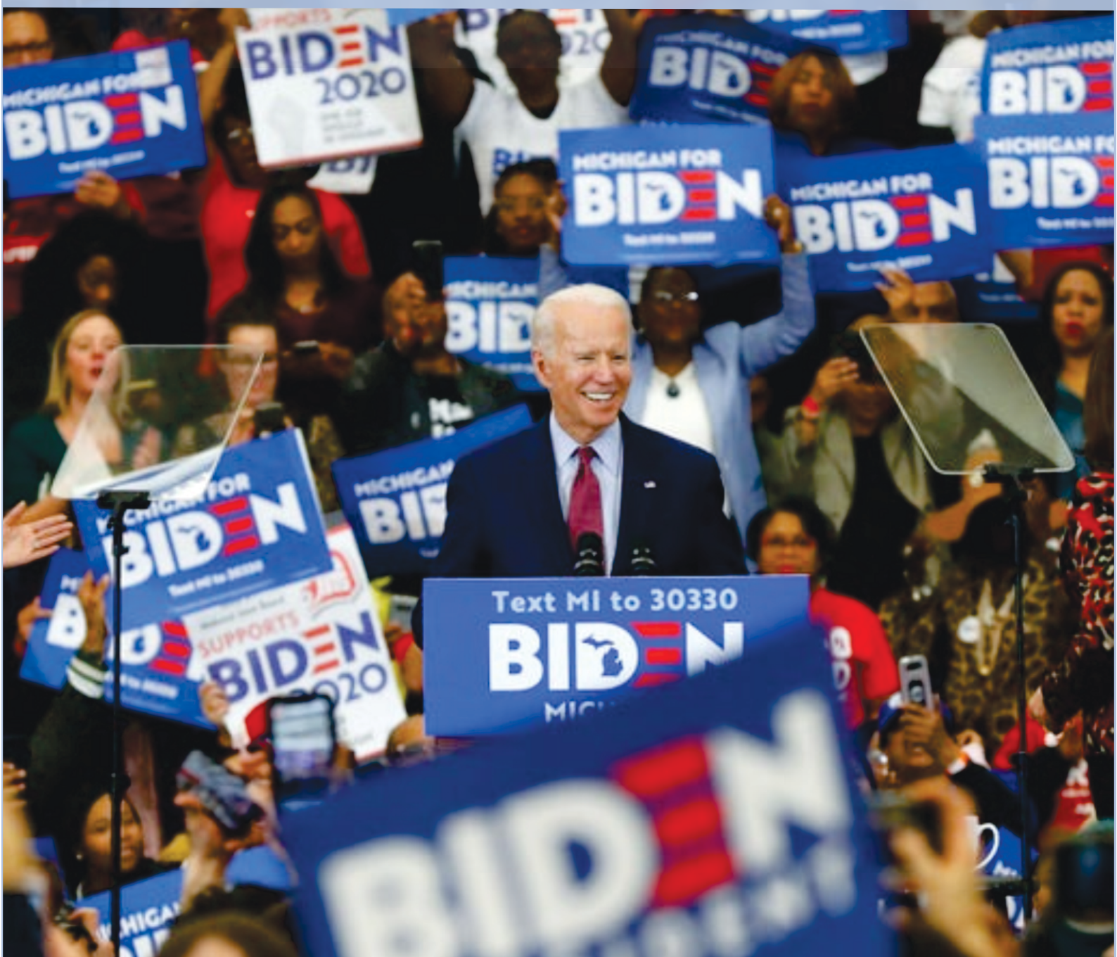
Democratic presidential candidate Joe Biden speaks during a campaign rally in Detroit.

Allow us to congratulate you on your impressive victory in the November 3 rd 2020 elections in the United States of America (U.S.A). Indeed, your campaign, and the aftermath of the elections have been truly unprecedented, especially amidst the raging COVID-19 pandemic. Your win of 81.2 million votes is also truly historic as it represents the highest number of votes cast for an American president.