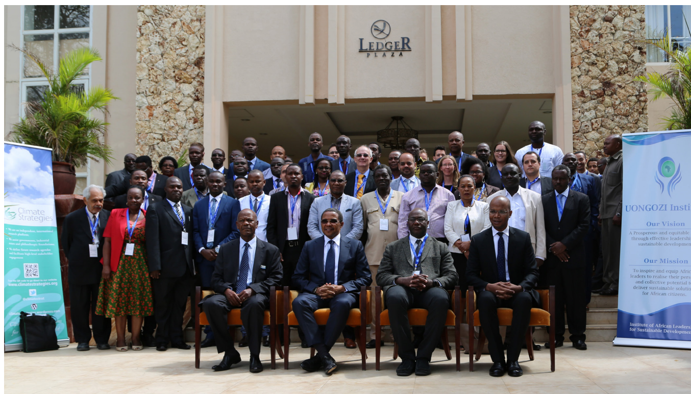
Photo: Group photo at GCPC 2016