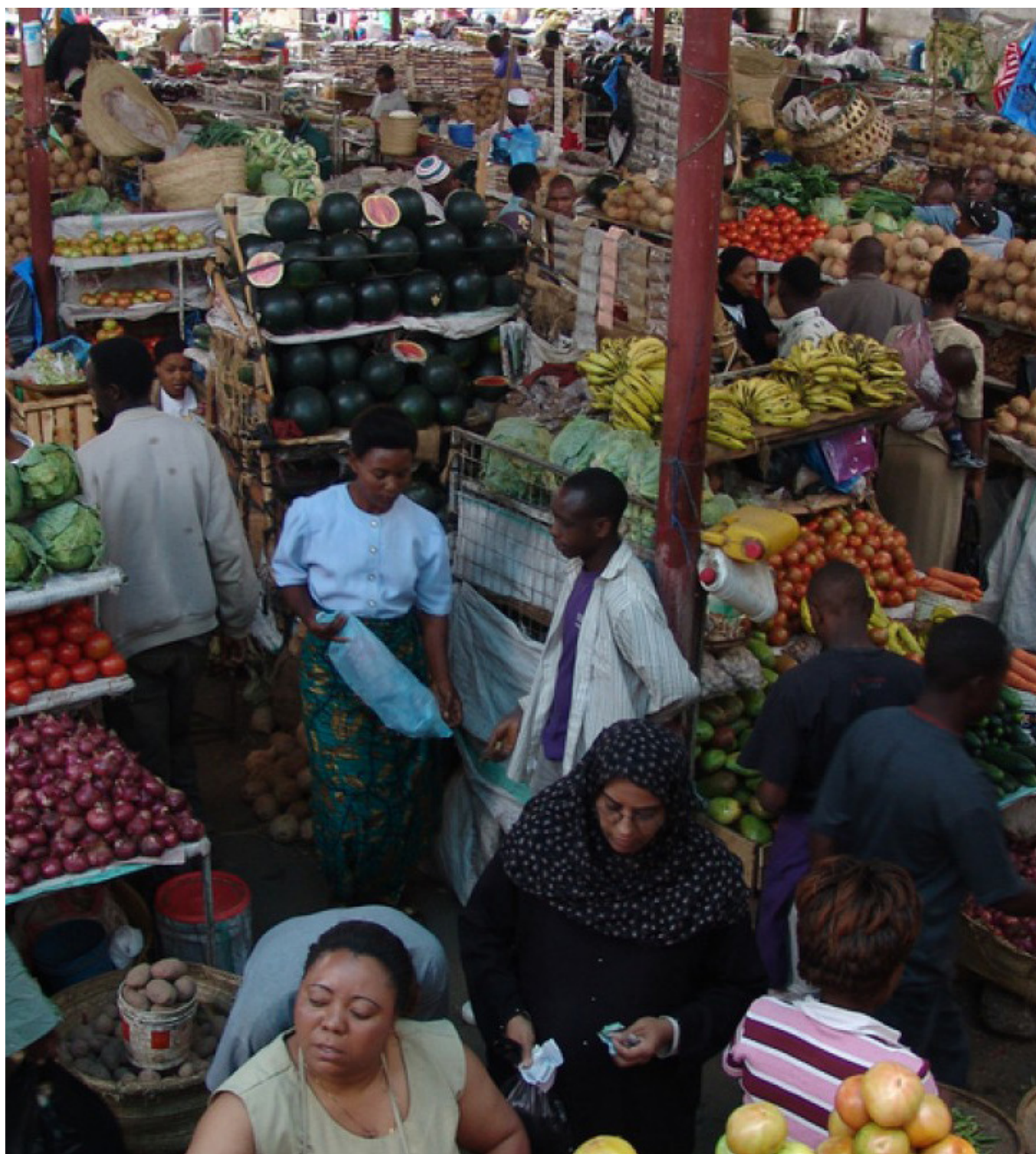
Photo: Market in Arusha, Tanzania, 2007.

A key conclusion was that Africa recognises the urgency of climate change given the continent's vulnerabilities, but lacks the resources and capacities to properly implement the INDCs. National contributions will not be enough in isolation and regional cooperation will have to be an integral part of the strategy to reach the targets agreed in Paris. "One doesn't simply pollute a country's air, but everyone's air," someone said in this regard. And while adaptation has not received due attention in research and policy discussions, it was agreed it cannot be separated from mitigation, so both will have to be addressed to succeed.