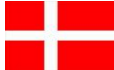
The Government of Denmark