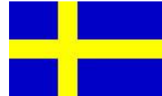
The Government of Sweden