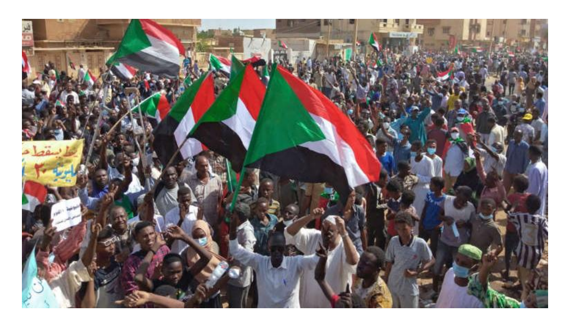
Demonstration in Omdurman on October 30, 2021

The agreement created important government organs for the period of the transition, namely the Sovereign Council, the Cabinet and the Legislative Council. The agreement stipulates that the Sovereign Council is to be made of eleven members; five from the military selected by TMC, five others from civilians selected by FFC and one civilian selected in agreement between the two.<sup>13</sup> The council is set to be chaired by a member from the TMC for 21 months and by a civilian member of the council for the remaining 18 months of the transition period. FFC retains the mandate to select the prime minister. Members of the Council of Ministers, not more than 20, were to be selected by the prime minister subject to approval by the Sovereign Council. Exceptions in this regard were, however, the ministers of defence and interior who are to be selected by the military members of the Sovereign Council and appointed by the prime minister, according to article 10 of the agreement.