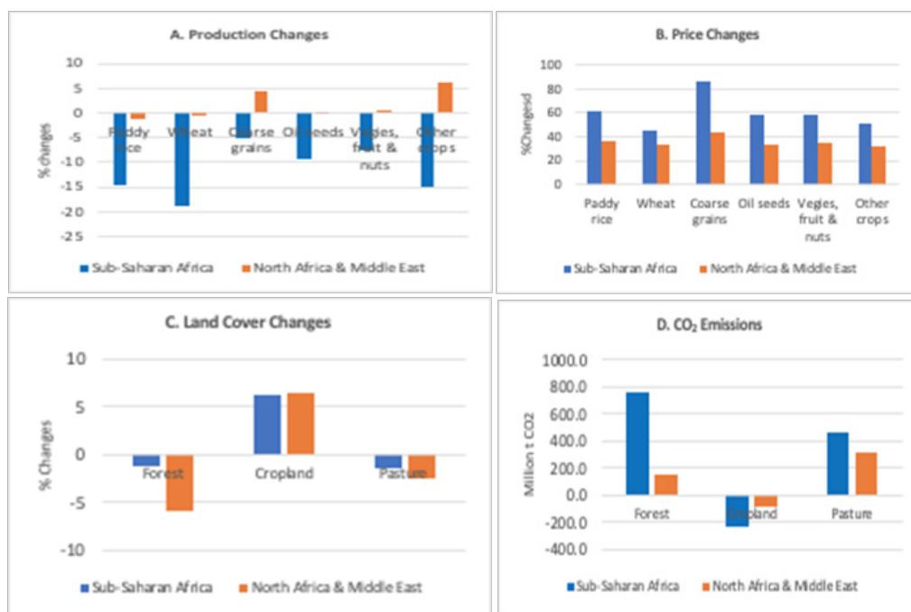
Figure 1: Impact of climate-induced low crop productivity on agriculture and the environment in Africa

The climate-induced crop productivity shocks under the low and medium scenarios for sub-Saharan Africa were applied in this simulation experiment. The imposition of these shocks allows us to track the changes in production, prices, land cover, and LCLUC-induced CO 2 emissions in the new equilibrium. Under the low crop productivity scenario, there are production declines across all crops for sub-Saharan Africa in 2030 (Figure 1A).