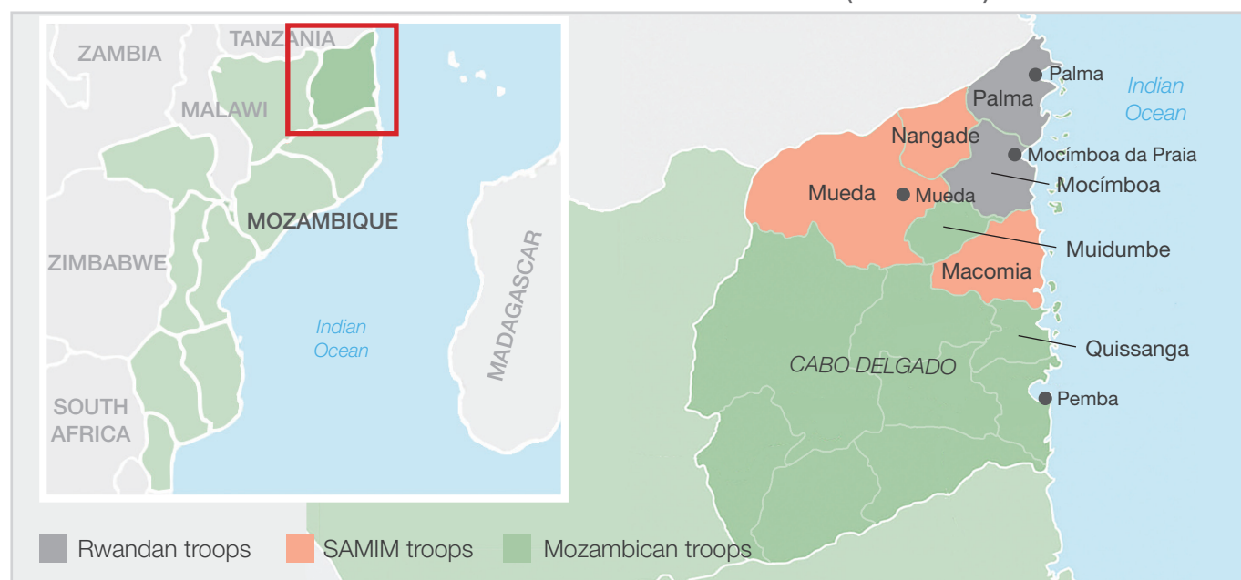
Chart 1: Territorial division of labour between SAMIM and Rwandan forces (March 2022)

By the end of 2021, coordination between SAMIM and Rwanda had been established on an operation level. 35